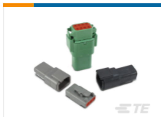
TE Part #DTM04-4P DEUTSCH DTM Housings