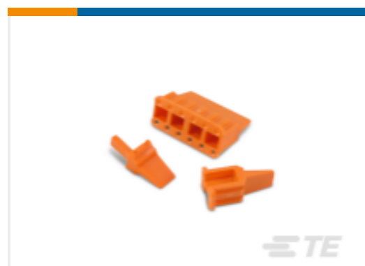
TE Part #WM-6S DEUTSCH DTM Wedgelocks