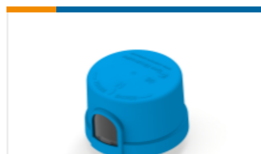
TE Part #PT553R-000 ALR-6090-VPS-UL