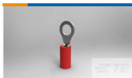
TE Part #36154 PIDG R 22-16 COMM 22-18 MIL 10