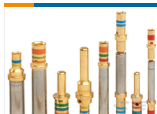
TE Part #0641-1-2031L CONT PIN