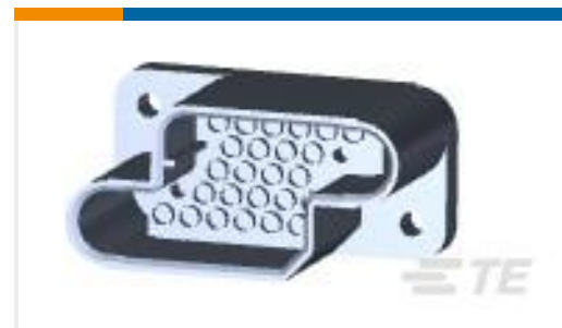
TE Part #211149-1 PIN HSG, 25 POSN, METRIMATE