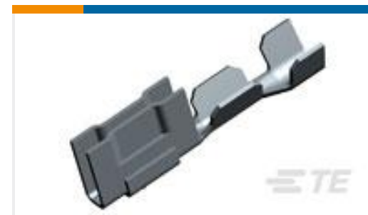
TE Part #1445336-2 LOOSE PC CONTACT 15 AU PLATED