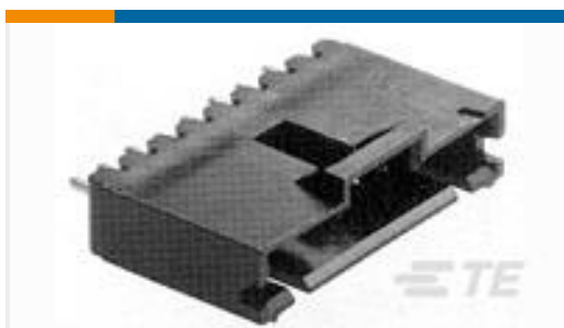
TE Part #5-104363-4 05 MTE HDR SRST LATCH .100CL