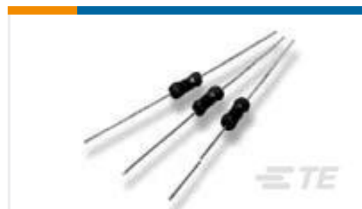
TE Part #1-1625890-7 2W SM M/OX 5% 180R