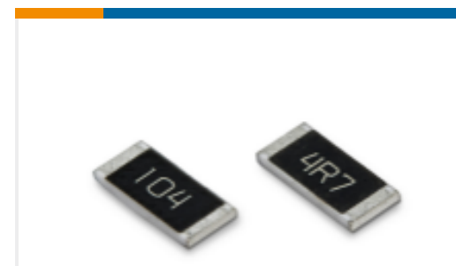
TE Part #2176456-1 CPF 0603 1R0 0.1% 25ppm 1K RL