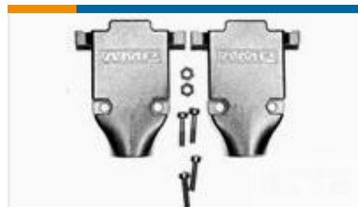
TE Part #5745173-4 CABLE CLAMP KIT, SZ 3