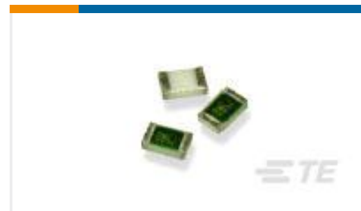
TE Part #9-1879212-8 CPF 0402 24R9 0.1% 25PPM 1K RL