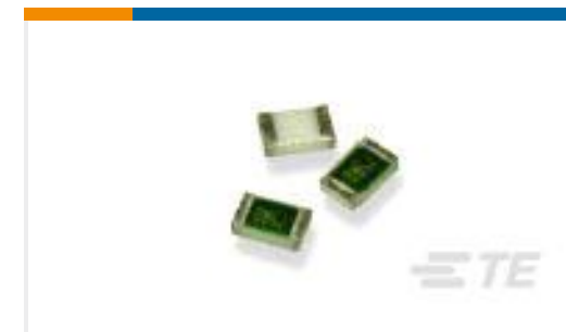
TE Part #9-1879215-7 CPF 0402 46K4 0.1% 25PPM 1K RL