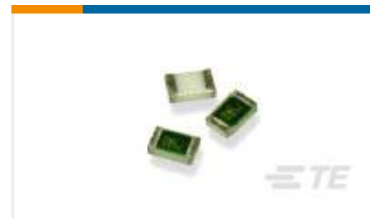
TE Part #9-1879215-4 CPF 0402 43K2 0.1% 25PPM 1K RL