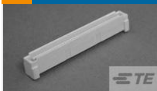
TE Part #5179031-2 0.8FH,P08H.5,060,08/Sn,TU