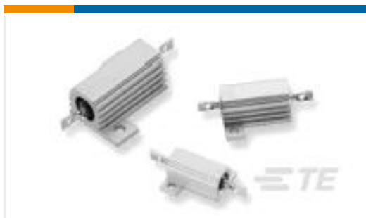
TE Part #2-1879075-9 THS25 27R 5%