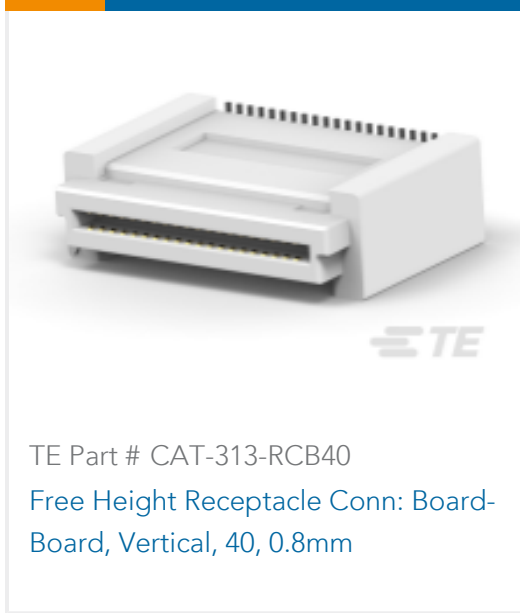
TE Part # CAT-313-RCB40 Free Height Receptacle Conn: Board-Board, Vertical, 40, 0.8mm