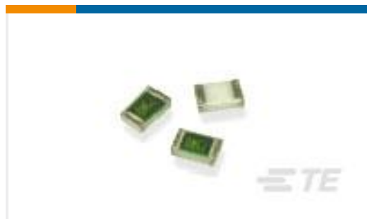
TE Part #1676298-2 RN 0805 301R 0.1% 10PPM 1KRL