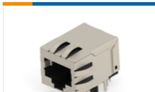
TE Part #203189-E MJIM IM 1X1 S 810 GF5 X R THRU ** M5B01