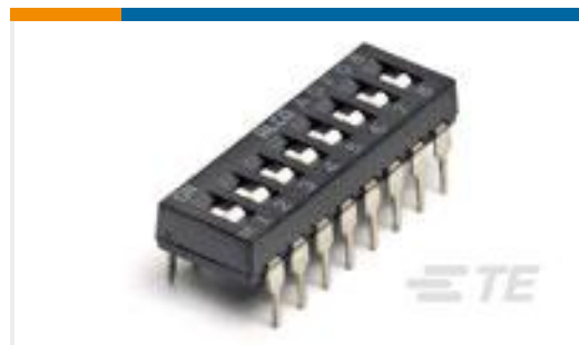
TE Part #1825059-1 ADF02S04=DIP SWT,FLUSH,SMT-GW