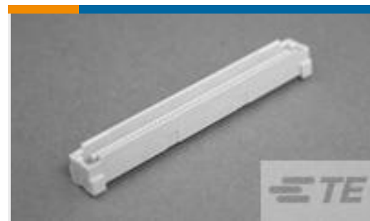
TE Part #5179029-1 0.8FH,P06H.5,040,08/Sn,TU