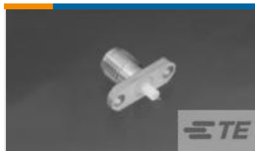
TE Part #1052902-1 2052 5674 02