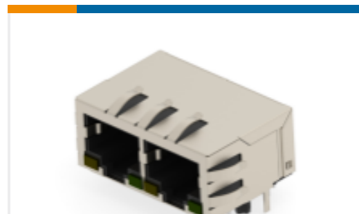
TE Part #203306-E MJIM IM 1X2 S 810 GF5 * R THRU * L1A M5B