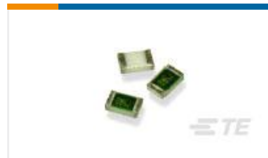
TE Part #1879417-1 CPF0603 510K 0.1% 25PPM 5K RL