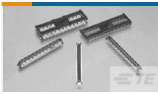
TE Part #6-5353606-6 .5FHR04H,220,S,GIG,08/Sn,HT,SEYes