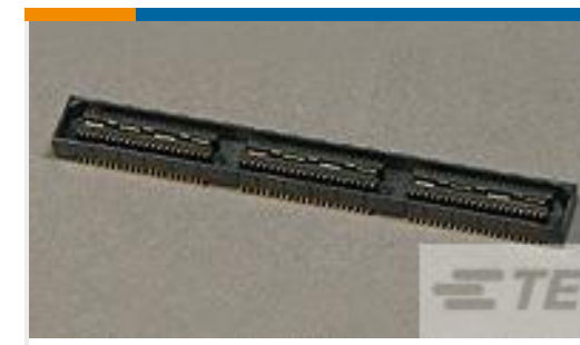
TE Part #7-1658012-3 MSB0.80RC-ASY84DP,-,10,VCTR