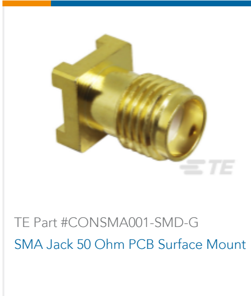
TE Part #CONSMA001-SMD-G SMA Jack 50 Ohm PCB Surface Mount