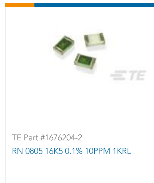
TE Part #1676204-2 RN 0805 16K5 0.1% 10PPM 1KRL