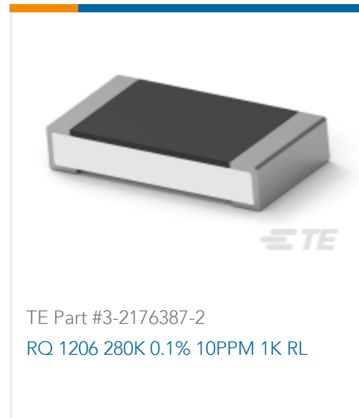
TE Part #3-2176387-2 RQ 1206 280K 0.1% 10PPM 1K RL