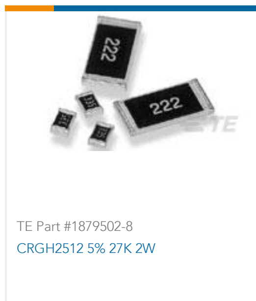
TE Part #1879502-8 CRGH2512 5% 27K 2W