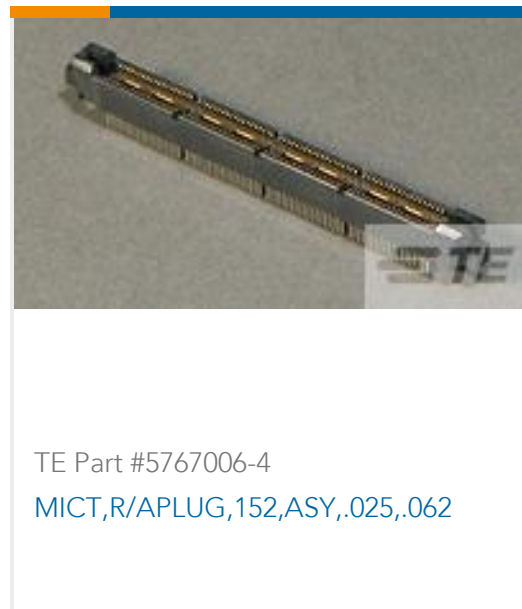
TE Part #5767006-4 MICT,R/APLUG,152,ASY,.025,.062