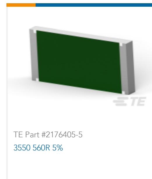
TE Part #2176405-5 3550 560R 5%