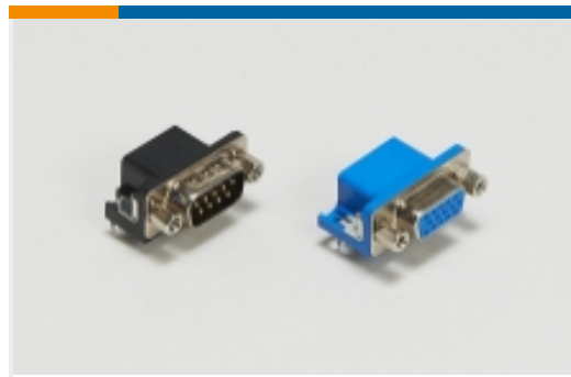
PCB D-Sub Connectors(172)