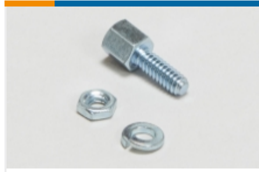
D-Sub Locking & Mounting(8)