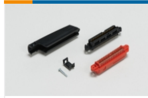
IDC D-Sub Connectors(66)