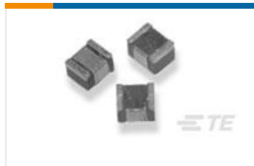
TE Part #8-1624112-1 3650 0603 36nH 5% 2K RL