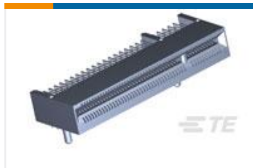
TE Part #1761465-3 PCI Express RA assy 5.8mm slot 2.3 mm pc