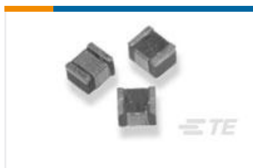
TE Part #9-1624112-4 3650 0603 0.39uH 5% 2K RL