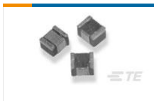
TE Part #1624112-1 3650 0603 10nH 5% 2K RL