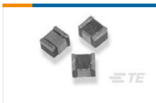
TE Part #7-1624112-2 3650 0603 8.7nH 5% 2K RL