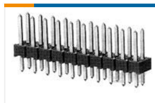
TE Part #826632-1 1P AMPMODU II PIN HDR