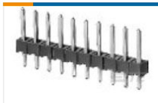
TE Part #5-146274-3 03 MODII HDR SRST B/A .100CL