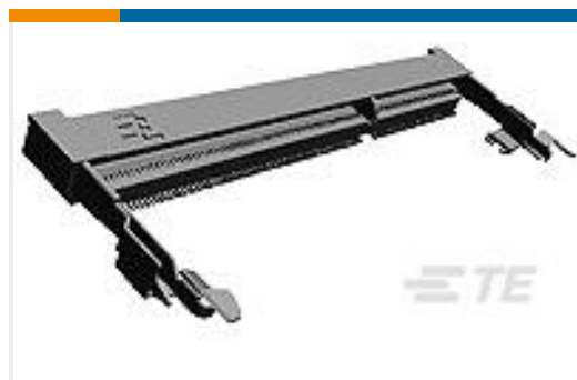
TE Part #2-2013287-1 EMBOSS TAPE DDR3 204P 4H RVS