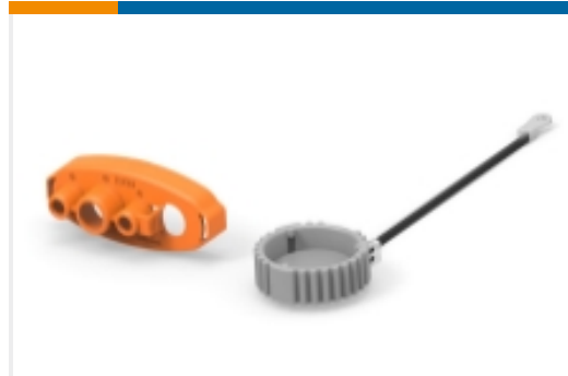
Connector Caps & Covers(20)