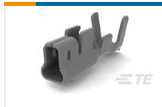
TE Part #1744423-1 EP 2.5 RCPT CONTACT, 24-20 AWG mm pc