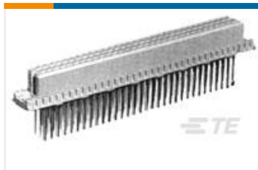
TE Part #1-148059-5 096 EURO TYP C RECP 17MM ASSY