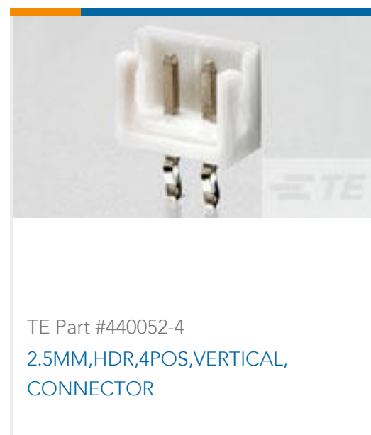
TE Part #440052-4 2.5MM,HDR,4POS,VERTICAL, CONNECTOR