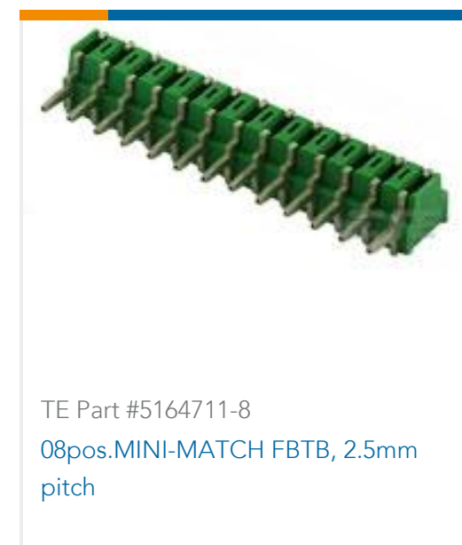
TE Part #5164711-8 08pos.MINI-MATCH FBTB, 2.5mm pitch