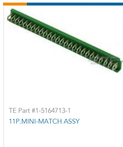
TE Part #1-5164713-1 11P.MINI-MATCH ASSY