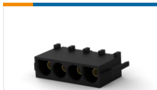
TE Part #794783-3 04P UMNL HDR ASSY, BLACK LF