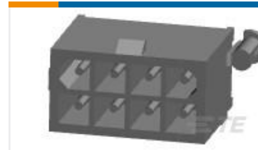
TE Part #794073-2 08P MINI UMNL HDR W/O DH AU