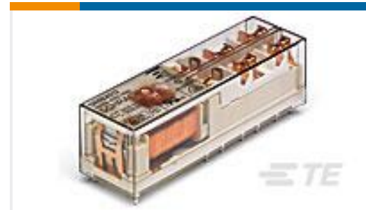
TE Part #1415062-1 SR6D4110