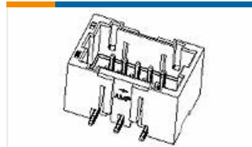
TE Part #2-292229-4 1.5 MINI CT D/R SMT 24P V ONTA