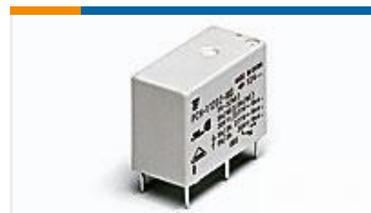
TE Part #9-1440003-1 PCH-106D2H,000