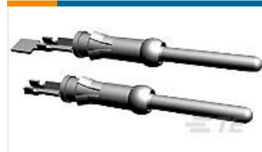
TE Part #66099-3 III+ PIN,18-16,15AU/FL,LP