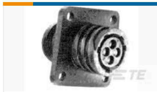
TE Part #206043-1 RECEPT,SZ 17-14 CPC