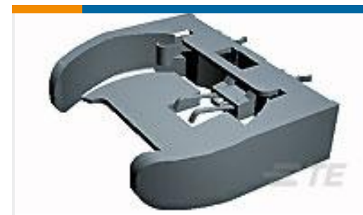
TE Part #2-1775485-1 Battery Holder, 3.6mm, BLK,low profile