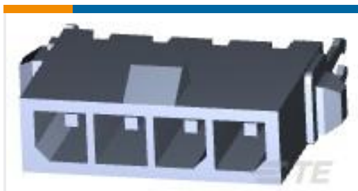
TE Part #2-1445085-4 micro mnl hdr Assy s/row au lf