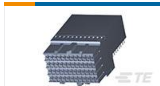
TE Part #1982738-2 Female Connector IEC