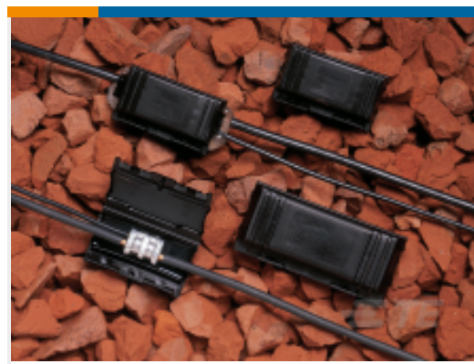
TE Part # 166533-000 GHFC-1-90(B100)