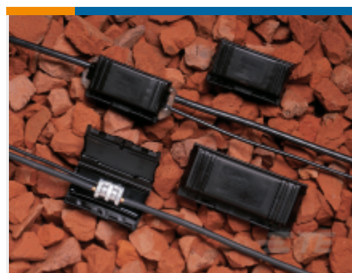
TE Part # 629995-000 GHFC-3-90(B18)