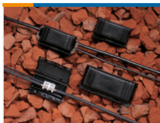
TE Part # 765669-000 GHFC-1-90(B10)