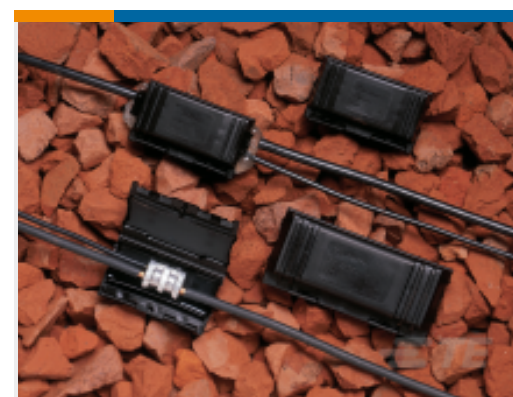
TE Part # C48562-000 GHFC-2.5-90(B300)