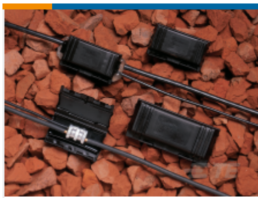
TE Part # 348333-000 GHFC-2-90(B100)