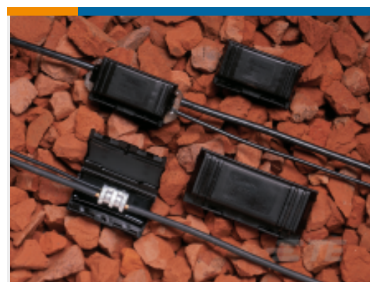
TE Part # 294925-000 GHFC-2-90(B10)