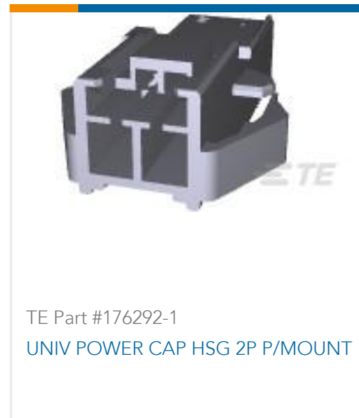
TE Part #176292-1 UNIV POWER CAP HSG 2P P/MOUNT