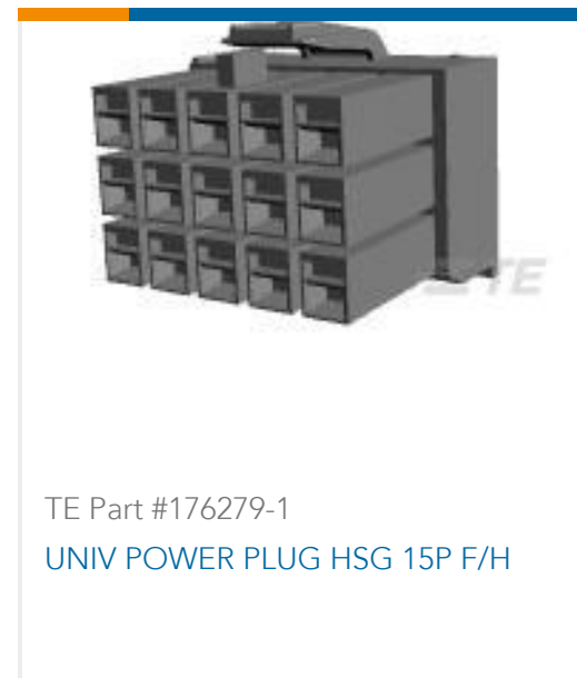
TE Part #176279-1 UNIV POWER PLUG HSG 15P F/H