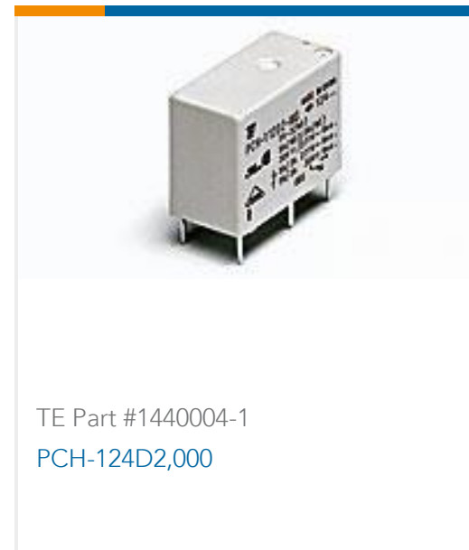
TE Part #1440004-1 PCH-124D2,000