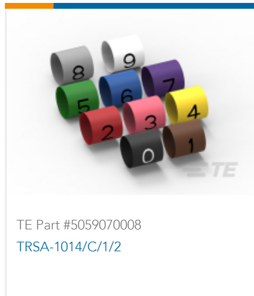
TE Part #5059070008 TRSA-1014/C/1/2