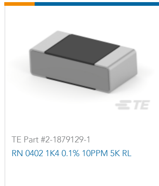
TE Part #2-1879129-1 RN 0402 1K4 0.1% 10PPM 5K RL