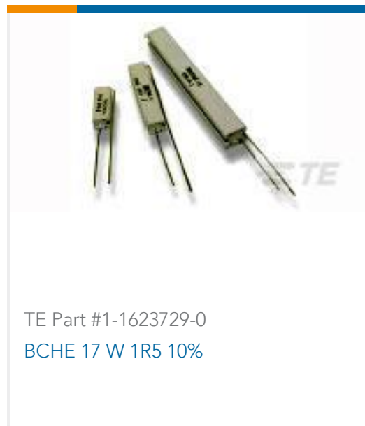
TE Part #1-1623729-0 BCHE 17 W 1R5 10%