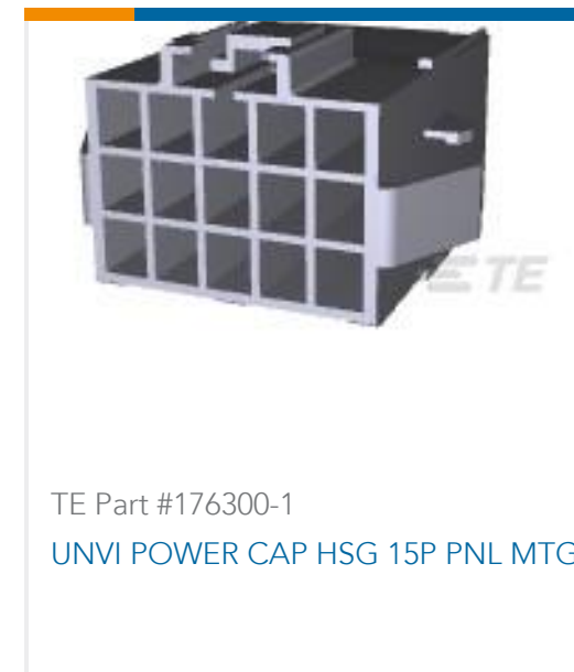
TE Part #176300-1 UNVI POWER CAP HSG 15P PNL MTG