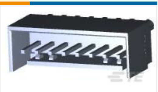
TE Part #3-644897-8 08P CST100 SHRD HDR ASSY LF