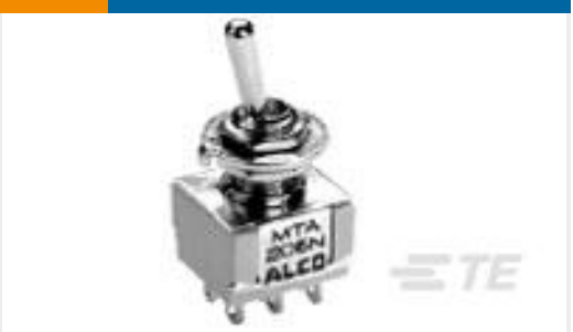
TE Part #3-1437558-5 MTA306D=(MSTA) SW TOG 3PDT