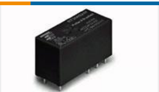
TE Part #3-1393237-3 RTE24024F