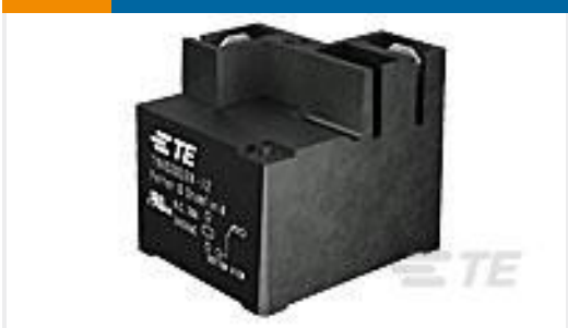
TE Part #3-1419104-6 T9AS5D22-24