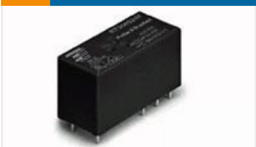
TE Part #3-1419108-1 RTD14024F