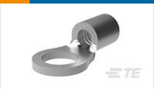
TE Part #2-34113-2 SOLIS R 22-16COMM 22-18MIL 1/4