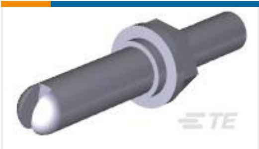
TE Part #1-200833-1 SERIES" M " GUIDE PIN ST. STL.