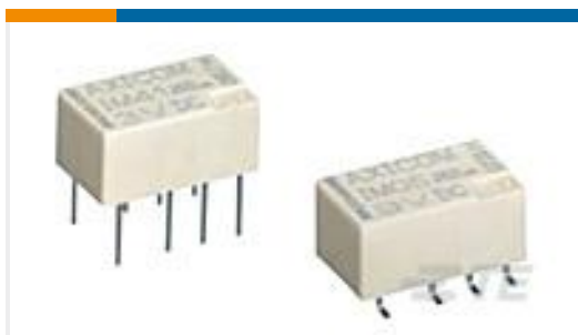
TE Part #2-1462037-3 IM06GR=IM Relay 140mW 12V