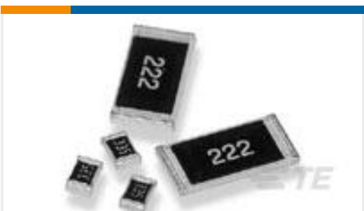
TE Part #1622828-1 CRG0603 1% 100R