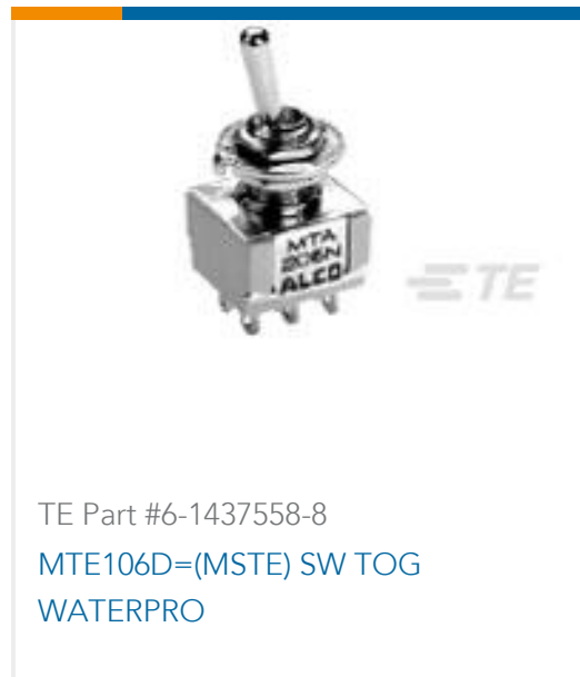
TE Part #6-1437558-8 MTE106D=(MSTE) SW TOG WATERPRO