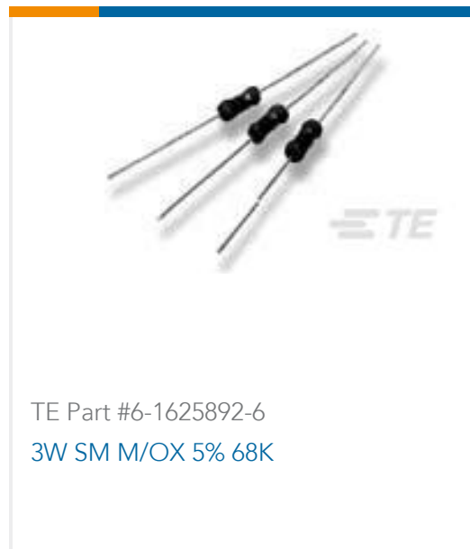
TE Part #6-1625892-6 3W SM M/OX 5% 68K