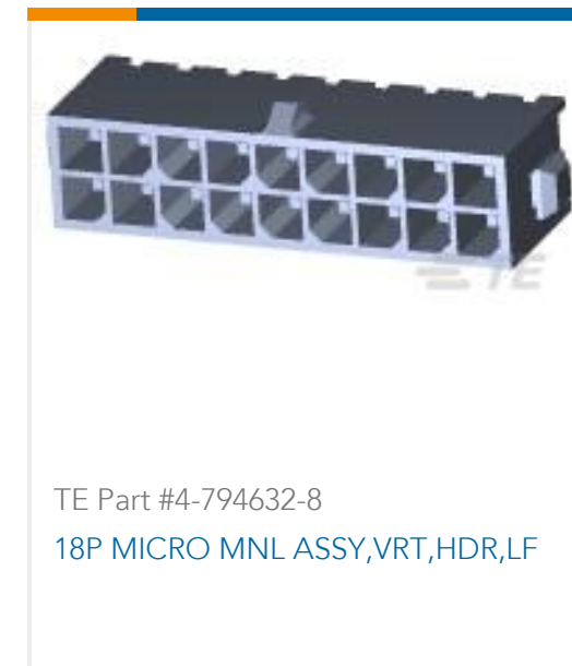
TE Part #4-794632-8 18P MICRO MNL ASSY,VRT,HDR,LF