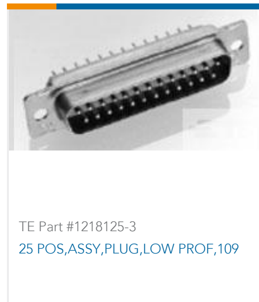
TE Part #1218125-3 25 POS,ASSY,PLUG,LOW PROF,109