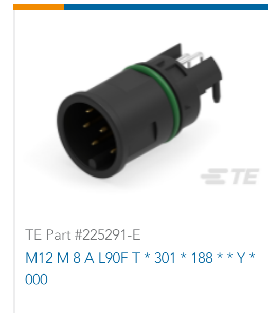
TE Part #225291-E M12 M 8 A L90F T * 301 * 188 ** Y * 000