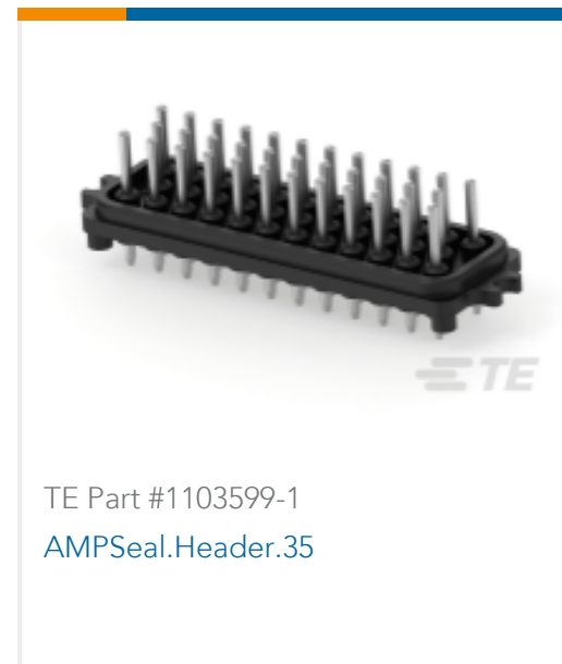
TE Part #1103599-1 AMPSeal.Header.35