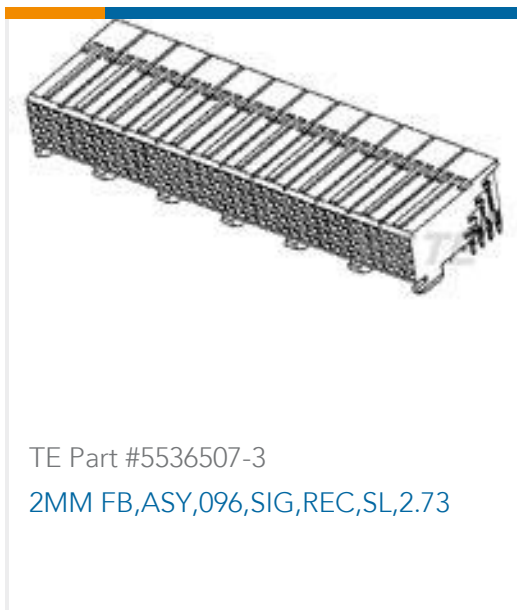
TE Part #5536507-3 2MM FB,ASY,096,SIG,REC,SL,2.73