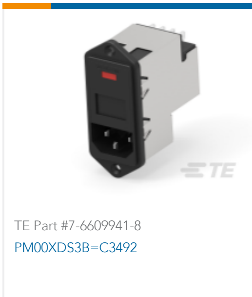
TE Part #7-6609941-8 PM00XDS3B=C3492