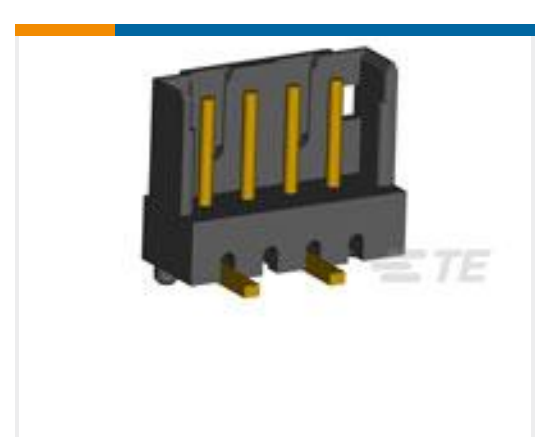
TE Part #292171-2 CT POST HDR ASSY 2P IN-TUBE BL