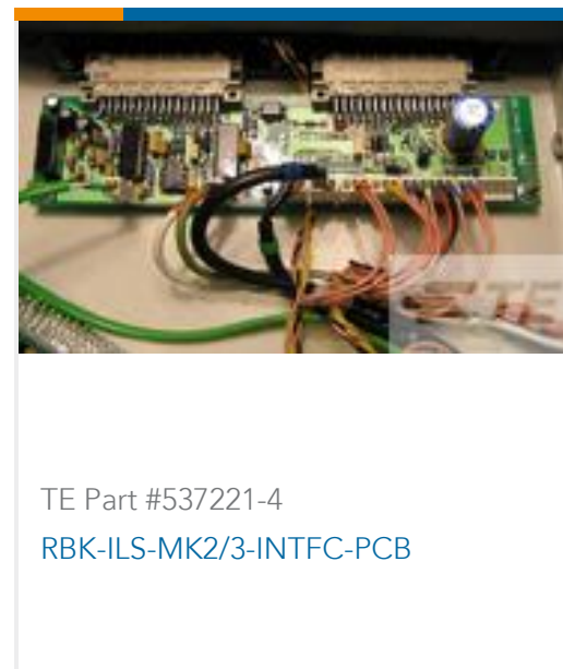
TE Part #537221-4 RBK-ILS-MK2/3-INTFC-PCB