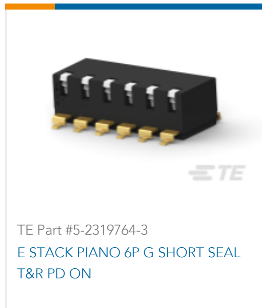
TE Part #5-2319764-3 E STACK PIANO 6P G SHORT SEAL T&R PD ON