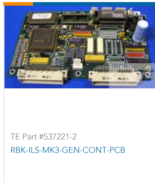
TE Part #537221-2 RBK-ILS-MK3-GEN-CONT-PCB