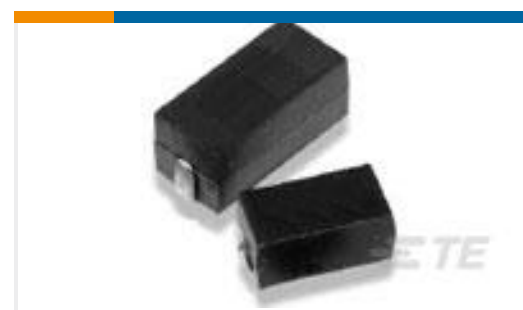
TE Part #3-1879233-7 SMW5 3R3 5%