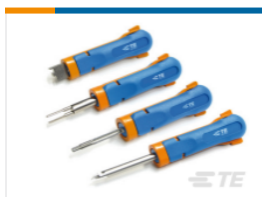
TE Part #69729 KNOCKOUT MIN SPR SKT W/O TIPS