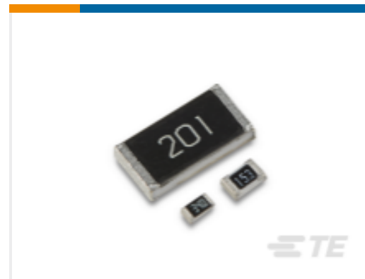
TE Part #1-2176325-7 CRGP 0402 220R 1%