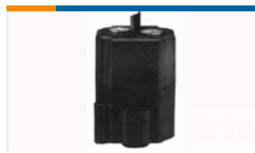
TE Part #2-1618002-6 EV250-2B=RELAY, 24VDC SPST-NO