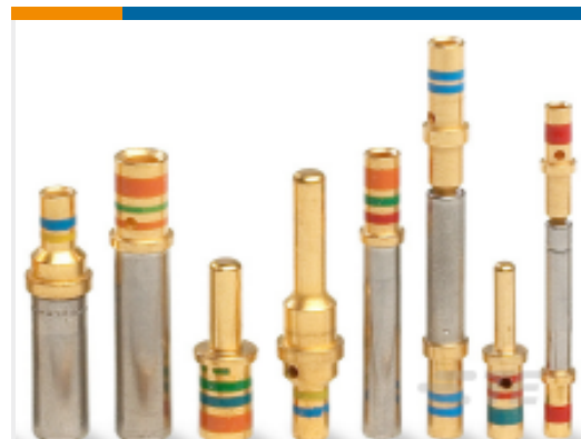
TE Part #2560-201-2031L CONT PIN