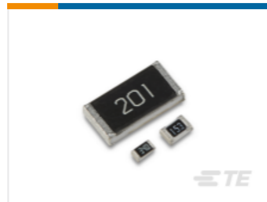
TE Part #3-2176325-7 CRGP 0402 10K 1%