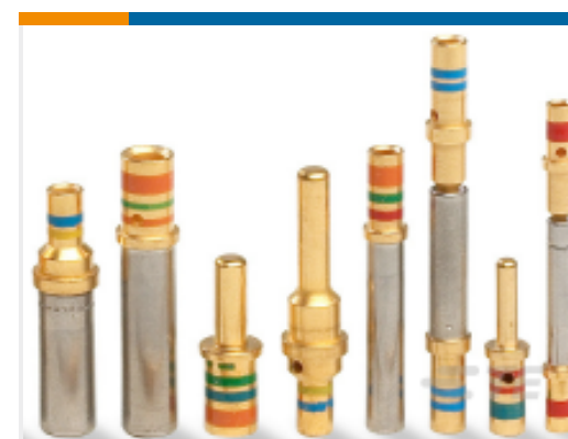
TE Part #2562-201-2031L CONT SOC ASSY