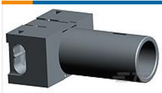
TE Part #1-2213222-1 NECTOR S BUS BAR SEALED US, THRU HV-3