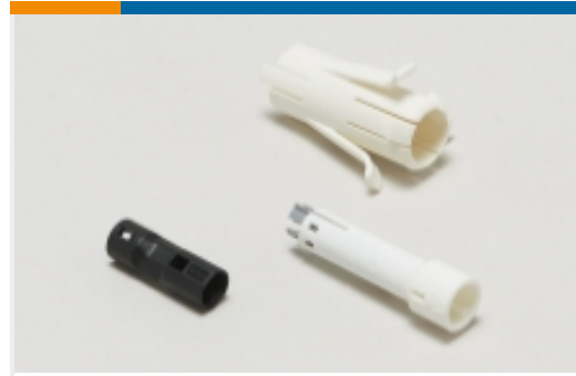
Plug & Socket Lighting Connector Accessories(57)