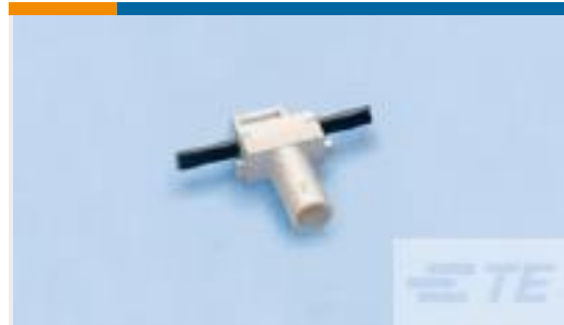
TE Part #293270-3 NECTOR S BUS BAR SEALED CONN HV-1