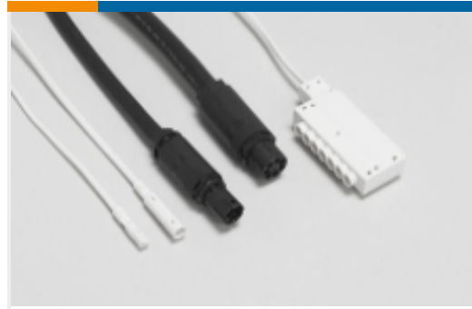
Lighting Cable Assemblies(1)