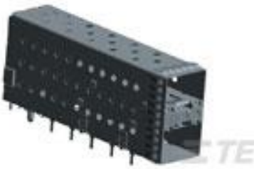
TE Part #1-2007492-7 SFP+assy2x1 EMI Sprg Outer Lp Sn Enhance