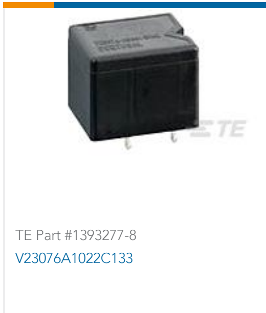
TE Part #1393277-8 V23076A1022C133