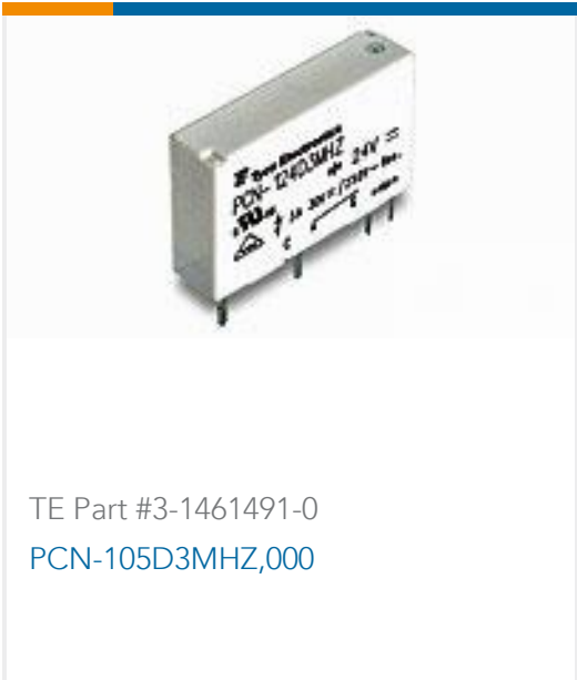
TE Part #3-1461491-0 PCN-105D3MHZ,000