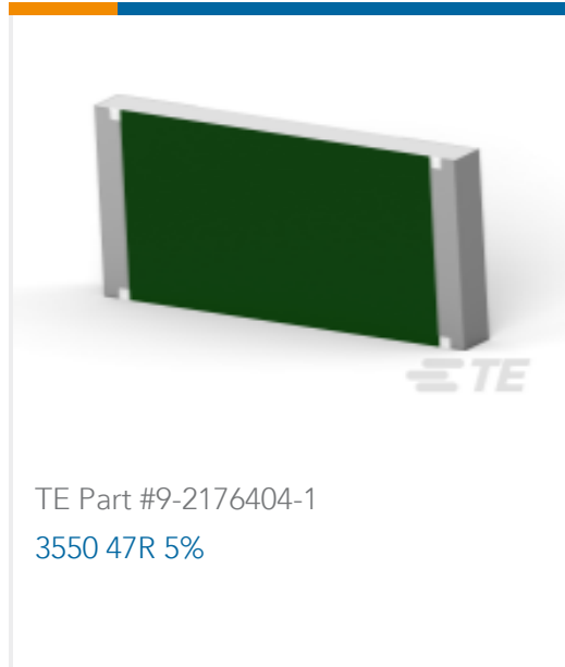
TE Part #9-2176404-1 3550 47R 5%