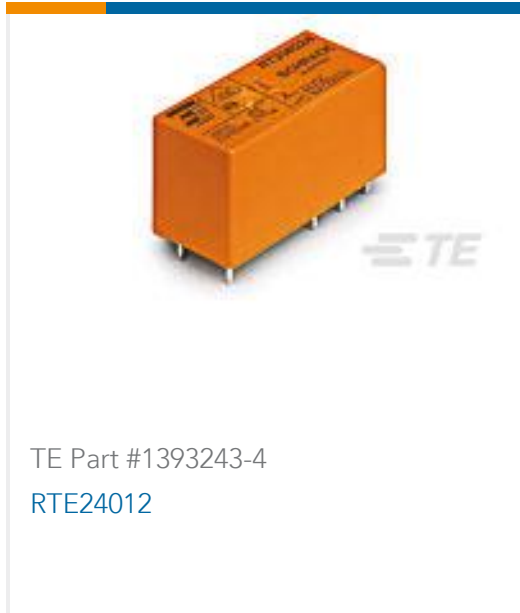
TE Part #1393243-4 RTE24012