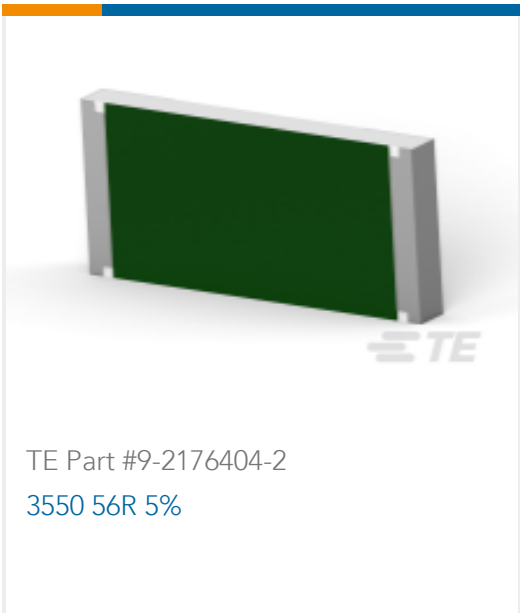
TE Part #9-2176404-2 3550 56R 5%