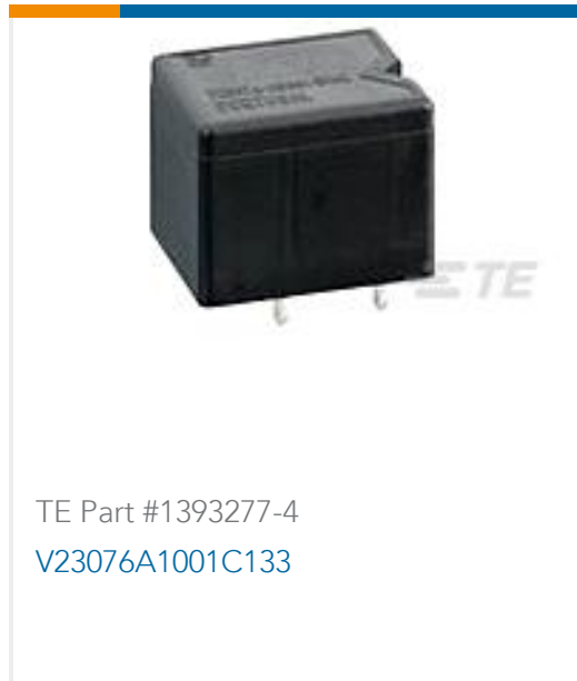
TE Part #1393277-4 V23076A1001C133