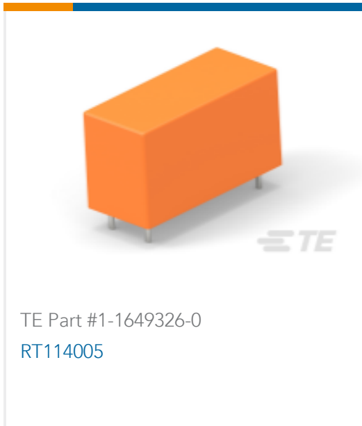
TE Part #1-1649326-0 RT114005