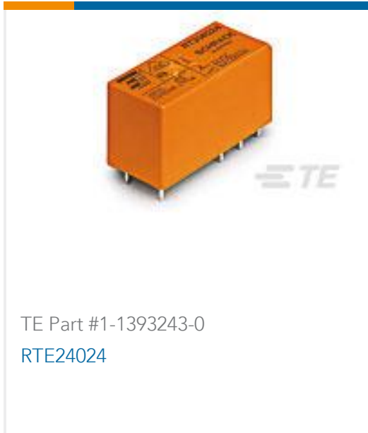
TE Part #1-1393243-0 RTE24024