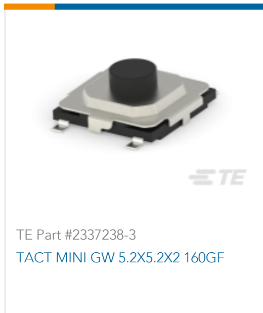
TE Part #2337238-3 TACT MINI GW 5.2X5.2X2 160GF