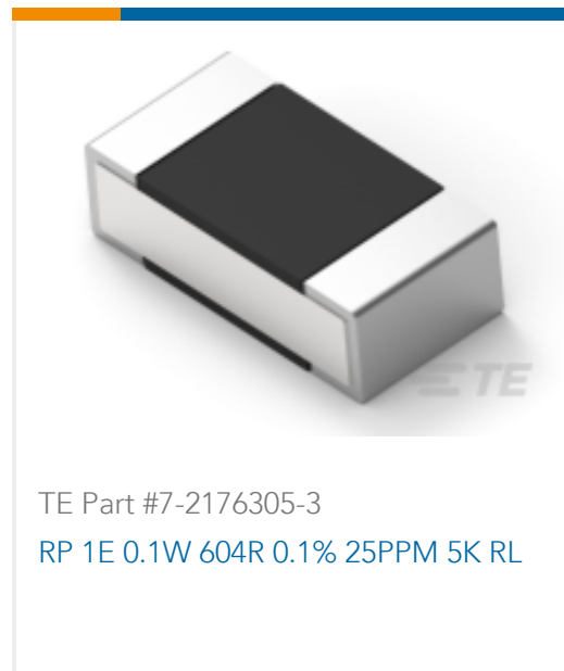
TE Part #7-2176305-3 RP 1E 0.1W 604R 0.1% 25PPM 5K RL