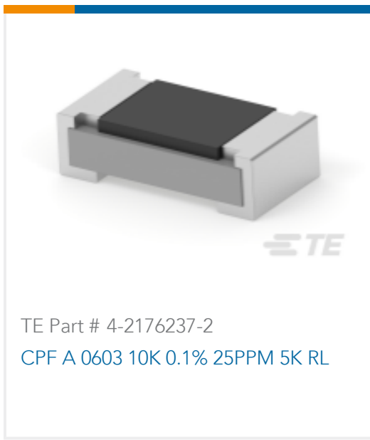
TE Part # 4-2176237-2 CPF A 0603 10K 0.1% 25PPM 5K RL