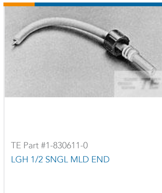
TE Part #1-830611-0 LGH 1/2 SNGL MLD END