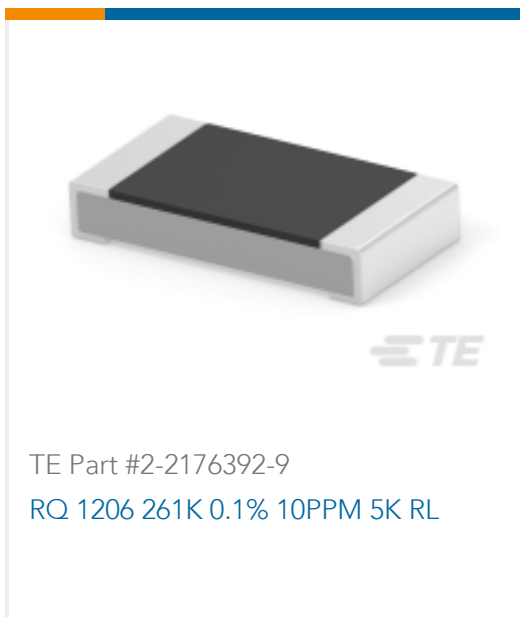
TE Part #2-2176392-9 RQ 1206 261K 0.1% 10PPM 5K RL