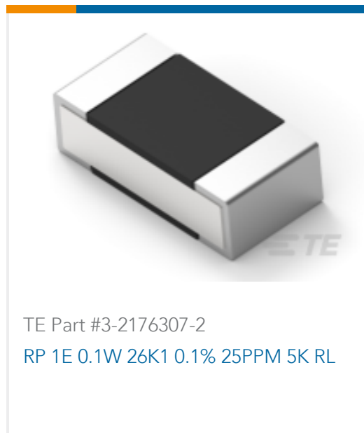
TE Part #3-2176307-2 RP 1E 0.1W 26K1 0.1% 25PPM 5K RL