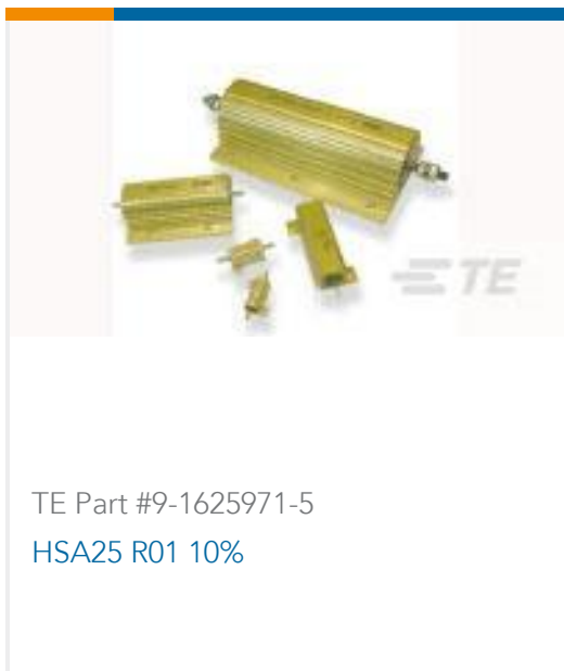
TE Part #9-1625971-5 HSA25 R01 10%