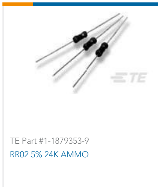
TE Part #1-1879353-9 RR02 5% 24K AMMO