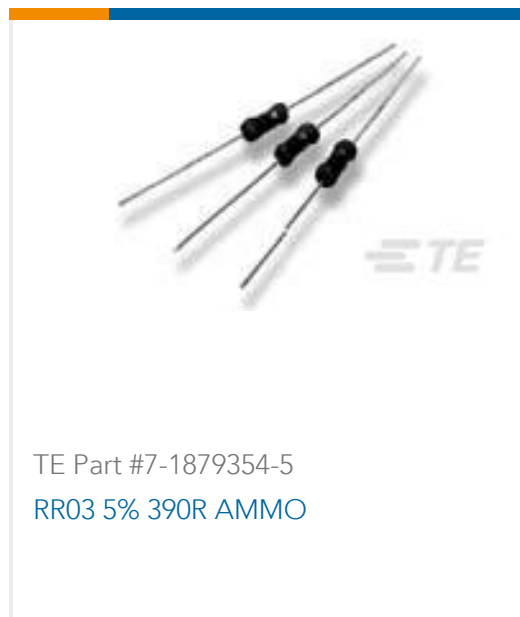
TE Part #7-1879354-5 RR03 5% 390R AMMO