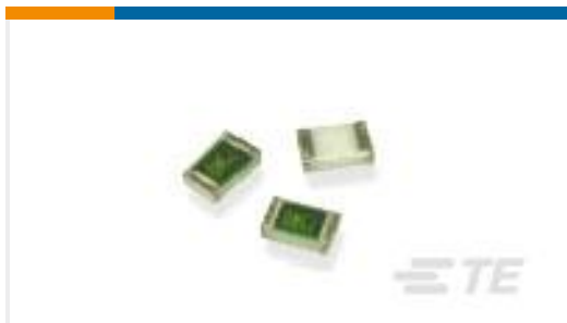
TE Part #7-2176091-1 RP 2A 0.25W 324R 0.1% 25PPM 1K RL