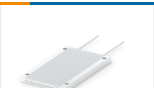
TE Part #2176250-6 TJT 500W 6R8 5%