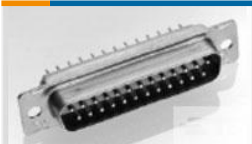
TE Part #1757823-7 AMPLIMITE,ASY,PLUG,STD,90,ZN,1,CT