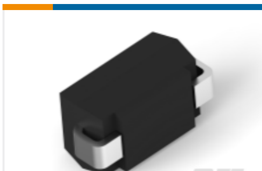
TE Part #1-2176322-9 SMV 1W 3M3 5%