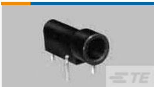
TE Part #350180 TEST PROBE ASSEMBLY, REC, PA66, BLACK