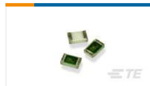
TE Part #2-1879215-6 CPF 0402 7K32 0.1% 25PPM 1K RL