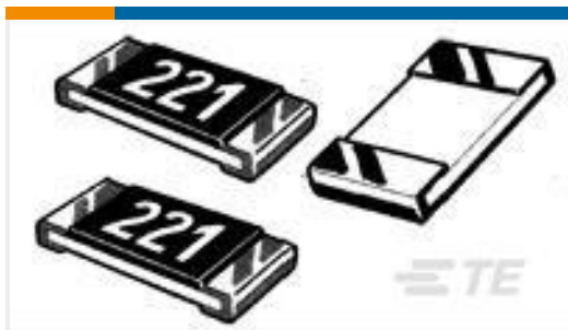
TE Part #3-1622820-4 3520 2R2 5%