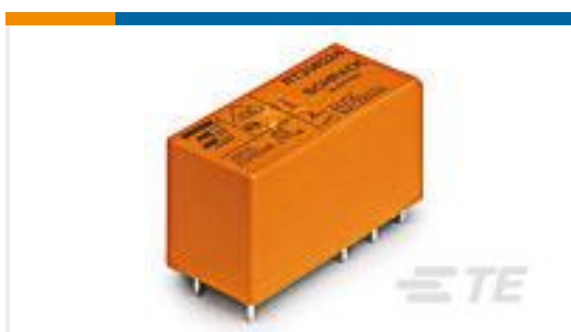
TE Part #6-1393238-2 RTD14012