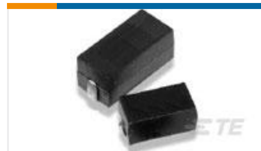
TE Part #4-1879233-4 SMW5 6R2 5%