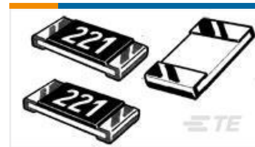
TE Part #6-2176231-7 3522 5K6 1% 3W