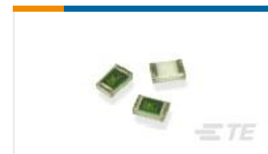
TE Part #7-1625868-3 RP 2A 0.25W 30R1 0.1% 25PPM 1K RL