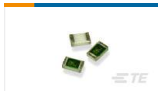
TE Part #1-1879214-9 CPF 0402 499R 0.1% 25PPM 1K RL