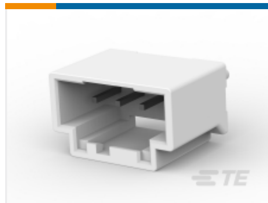
TE Part # 4-1971798-1 NEW GI CONN2.5 HDR ASMBLY 4P NC D1.0