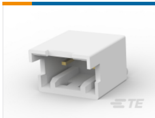
TE Part # CAT-G7534A-H342A Glow Wire Sig GRACE INERTIA Header