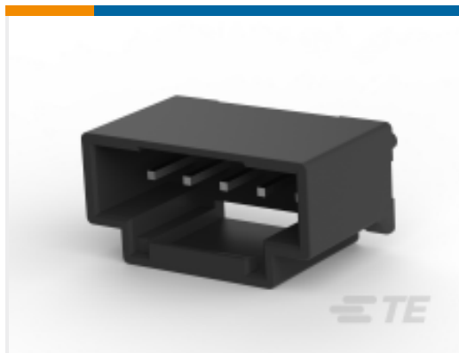
TE Part # 5-1971798-5 NEW GI CONN2.5 HDR ASMBLY 5P BLK D1.0