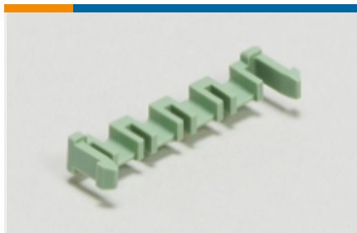
PCB Latches, Locks & Retainers(5)