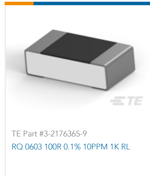
TE Part #3-2176365-9 RQ 0603 100R 0.1% 10PPM 1K RL