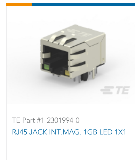
TE Part #1-2301994-0 RJ45 JACK INT.MAG. 1GB LED 1X1