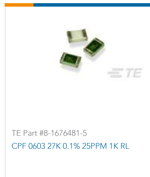
TE Part #8-1676481-5 CPF 0603 27K 0.1% 25PPM 1K RL