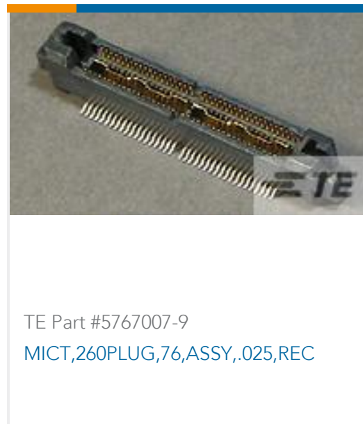
TE Part #5767007-9 MICT,260PLUG,76,ASSY,.025,REC