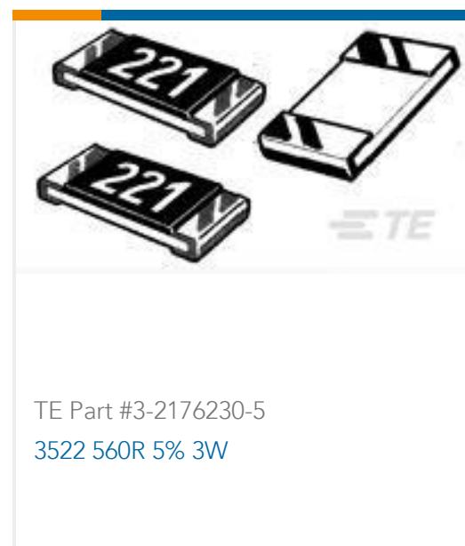
TE Part #3-2176230-5 3522 560R 5% 3W