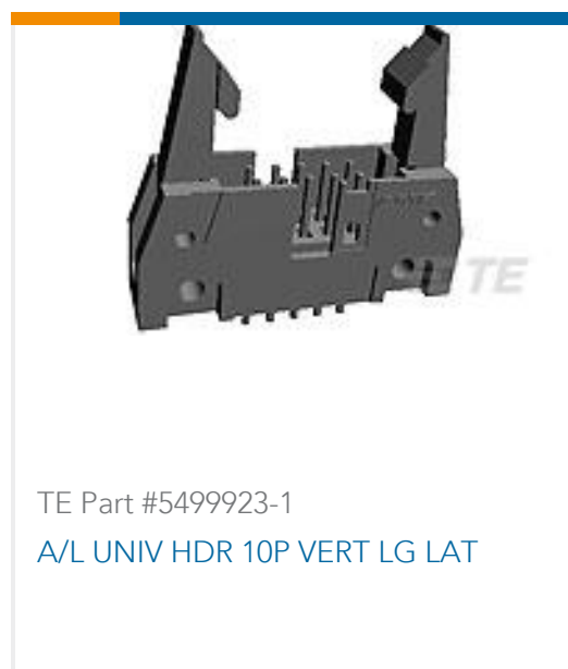
TE Part #5499923-1 A/L UNIV HDR 10P VERT LG LAT