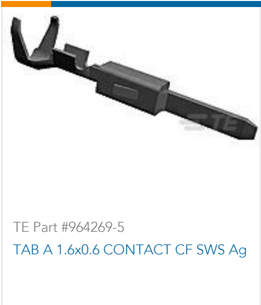
TE Part #964269-5 TAB A 1.6x0.6 CONTACT CF SWS Ag