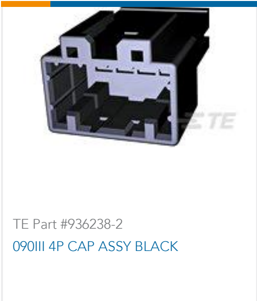
TE Part #936238-2 090III 4P CAP ASSY BLACK