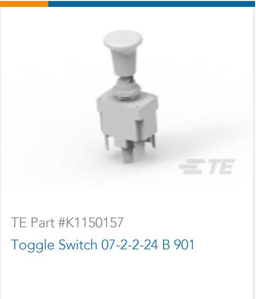
TE Part #K1150157 Toggle Switch 07-2-2-24 B 901