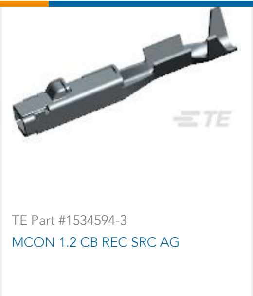
TE Part #1534594-3 MCON 1.2 CB REC SRC AG