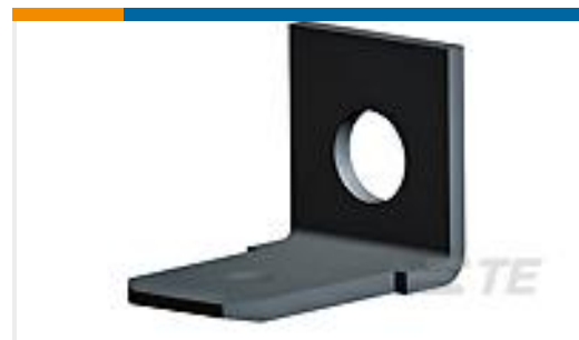
TE Part #42214-1 250 FASTON TAB BR