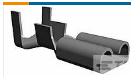
TE Part #61945-1 187 FASTON REC 18-16 AWG TPBR