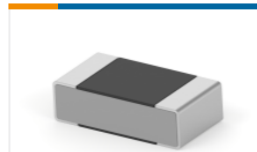
TE Part #6-1879135-1 RN 0603 4R99 0.1% 10PPM 5K RL