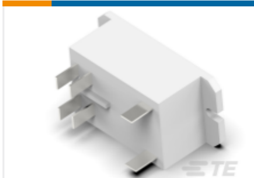
TE Part #6-1423008-8 T92S7D2X-24-99