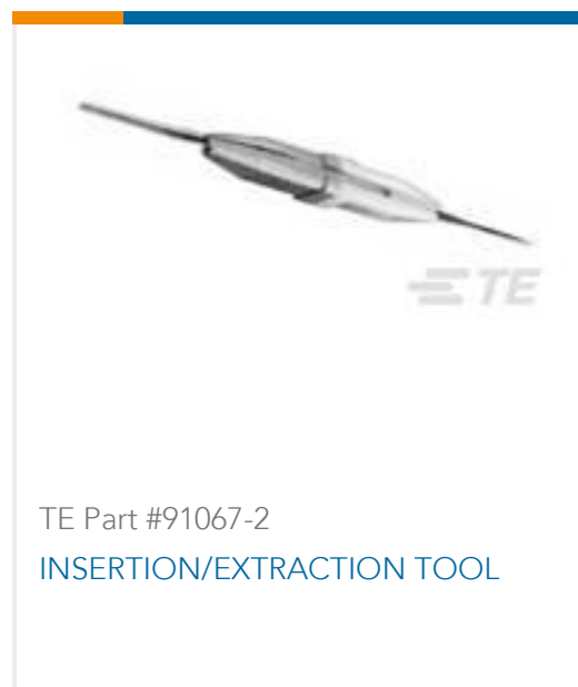
TE Part #91067-2 INSERTION/EXTRACTION TOOL