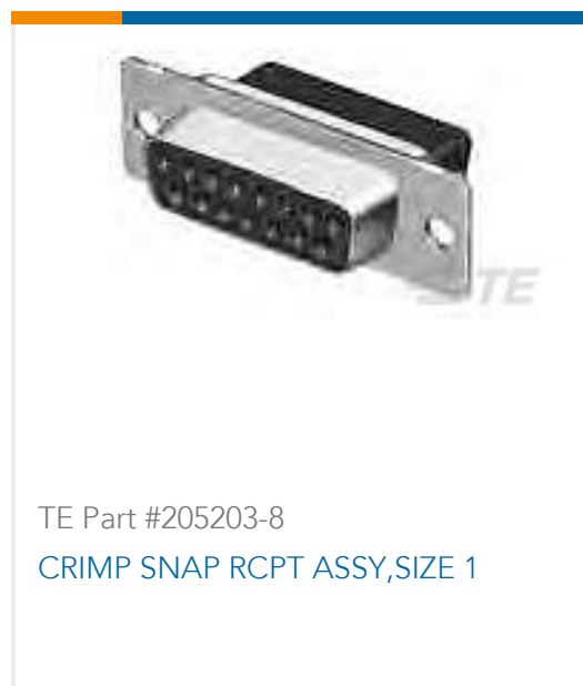
TE Part #205203-8 CRIMP SNAP RCPT ASSY, SIZE 1