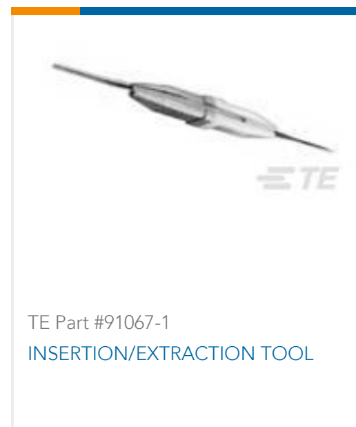
TE Part #91067-1 INSERTION/EXTRACTION TOOL