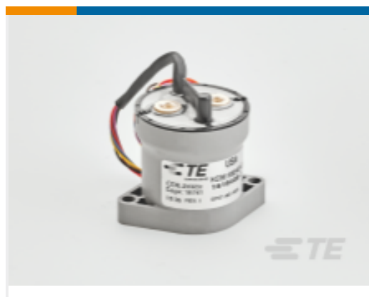
TE Part #1618408-3 KCS01X024EACA=CONTACTOR, CURRENT SENSE