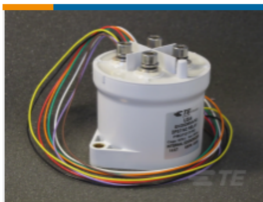
TE Part # 5-1618407-2 EV202MSBFD=RELAY, EV202 DPST-NO, 28V