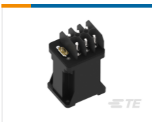
TE Part #5-1617818-0 FCC-360-CU4 =OVERALL_TH