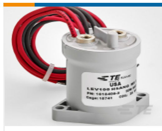
TE Part #1618408-2 LEV100H5CNG = CONTACTOR WITH AUX SPST