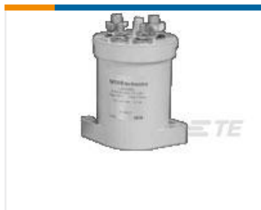
TE Part #9-1618389-8 LEV100A5ANG=RELAY, SPST, 24Vdc