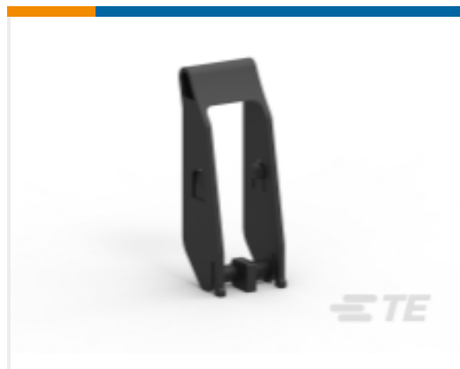
TE Part #2022103-1 RT17017