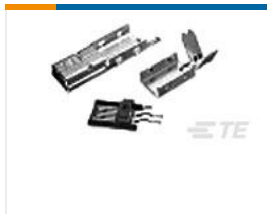
TE Part #1734205-1 MINI USB, TYPE B, PLUG. CABLE-KIT