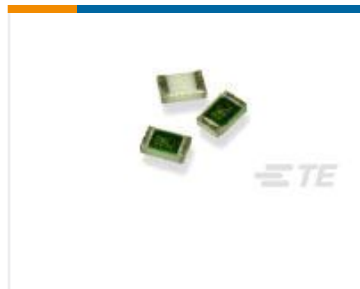
TE Part #3-2176217-3 CPF A 0805 1K0 0.1% 25PPM 1K RL