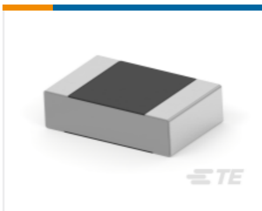
TE Part #4-2176238-9 CPF A 0805 10K 0.1% 25PPM 5K RL