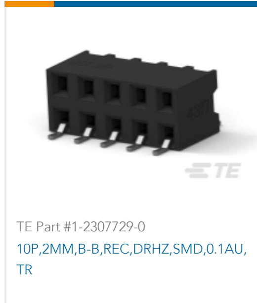
TE Part #1-2307729-0 10P,2MM,B-B,REC,DRHZ,SMD,0.1AU, TR