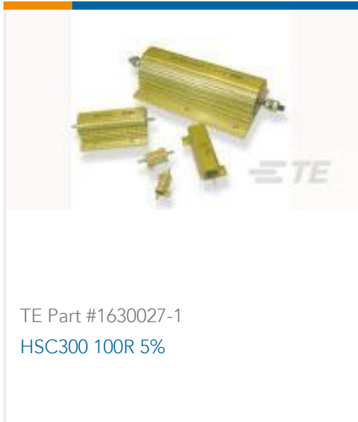
TE Part #1630027-1 HSC300 100R 5%