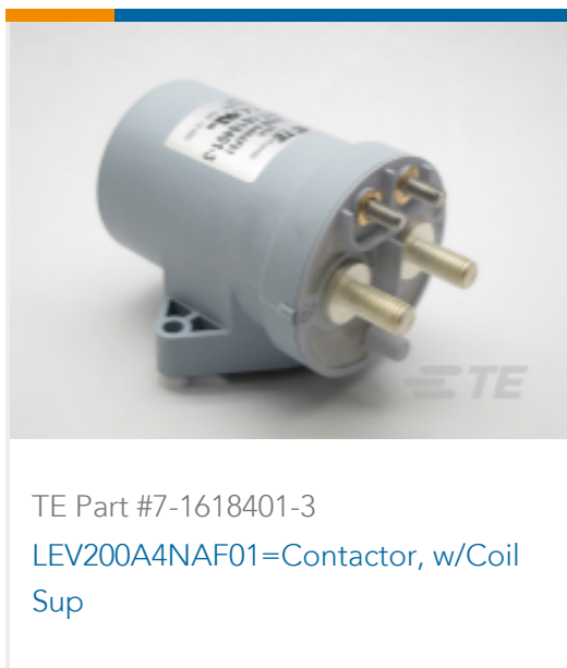
TE Part #7-1618401-3 LEV200A4NAF01=Contactor, w/Coil Sup