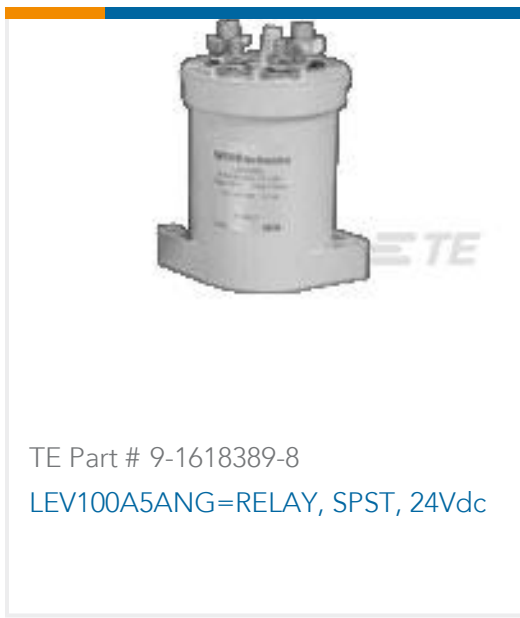
TE Part # 9-1618389-8 LEV100A5ANG=RELAY, SPST, 24Vdc