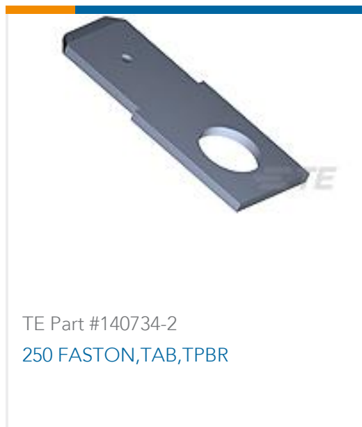
TE Part #140734-2 250 FASTON,TAB,TPBR