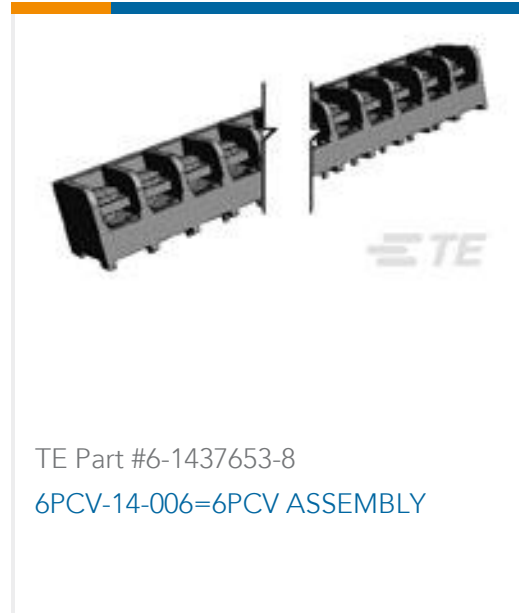
TE Part #6-1437653-8 6PCV-14-006=6PCV ASSEMBLY