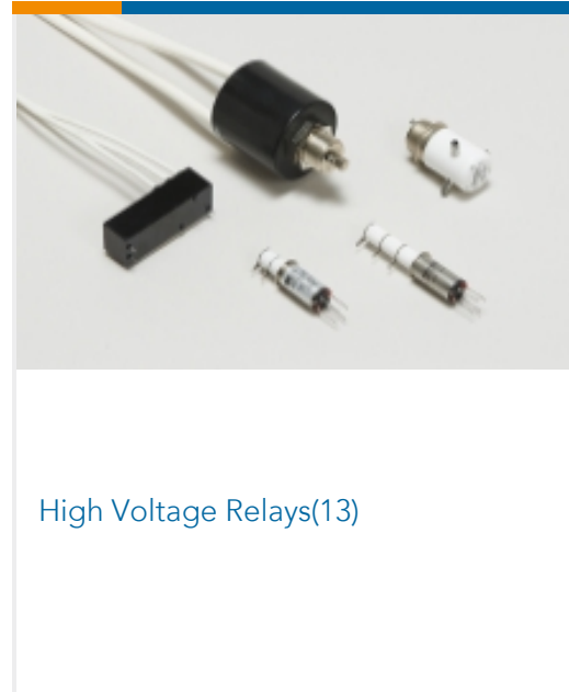
High Voltage Relays(13)