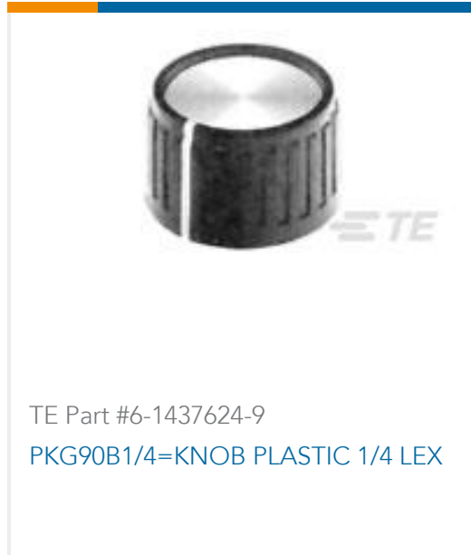
TE Part #6-1437624-9 PKG90B1/4=KNOB PLASTIC 1/4 LEX