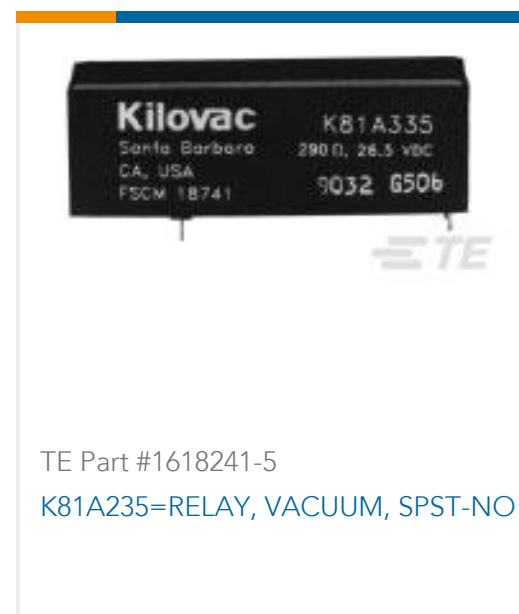
TE Part #1618241-5 K81A235=RELAY, VACUUM, SPST-NO