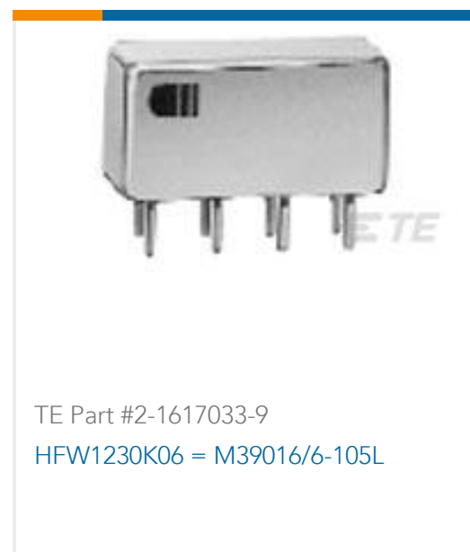
TE Part #2-1617033-9 HFW1230K06 = M39016/6-105L