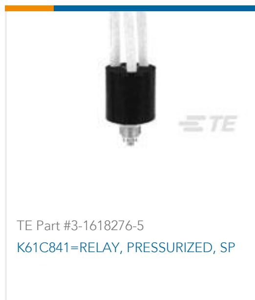
TE Part #3-1618276-5 K61C841=RELAY, PRESSURIZED, SP