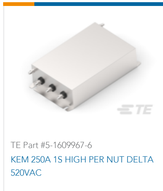
TE Part #5-1609967-6 KEM 250A 1S HIGH PER NUT DELTA 520VAC