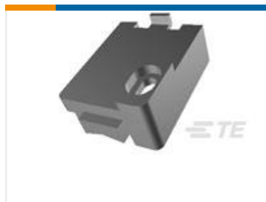
TE Part #1-640721-0 06P UMNL STR/REL & INSRT NATL