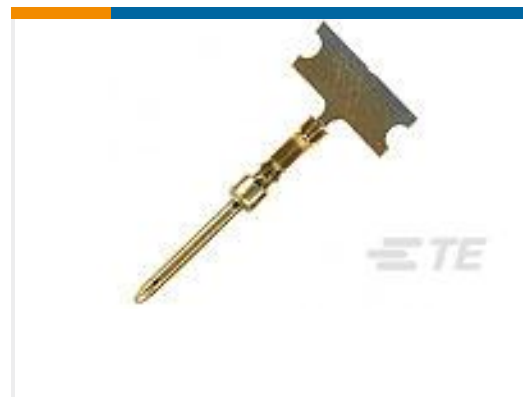
TE Part #166053-1 COSI PIN CONTACT HD20 DF; 24-20 AWG