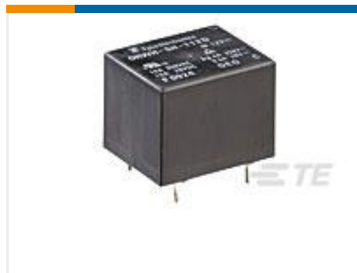
TE Part #1-1721150-0 ORWH-SH-105D1F,000