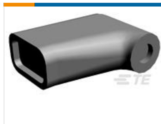
TE Part #170891-1 250 FASTON HSG,FLAG,REC., NATRUAL