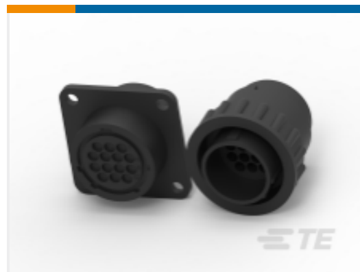
TE Part #182651-1 CPC EMEA