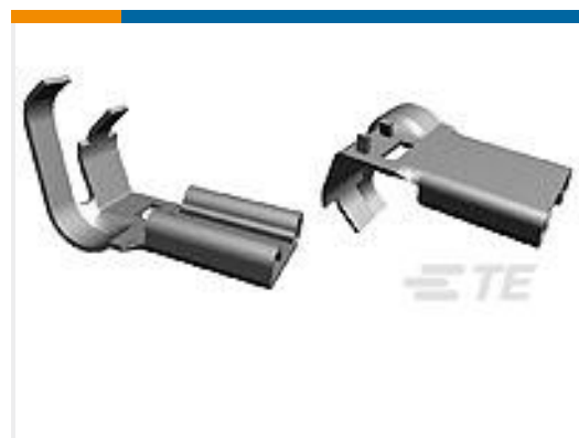
TE Part #41898 250 FASTON FLAG REC 18-12 AWG TPBR