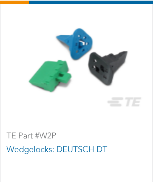
TE Part #W2P Wedgelocks: DEUTSCH DT