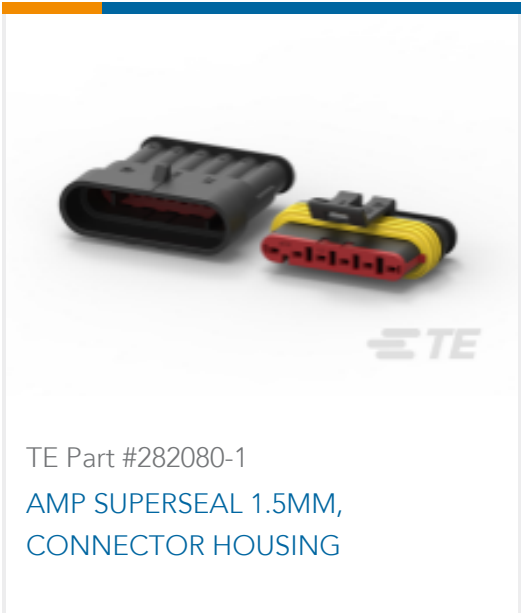
TE Part #282080-1 AMP SUPERSEAL 1.5MM, CONNECTOR HOUSING