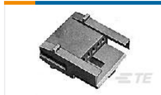
TE Part #172211-8 8P CAP HSG FREE HABG EI S CONN