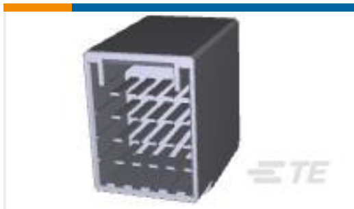
TE Part #917251-3 DYNAMIC D-3400F HDR ASSY 20P H