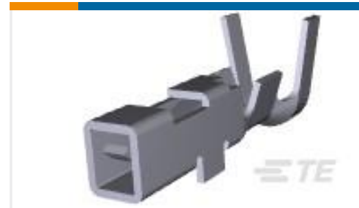
TE Part #1827588-2 DYNAMIC D1000 REC CONT L AU 0.38 um L/P