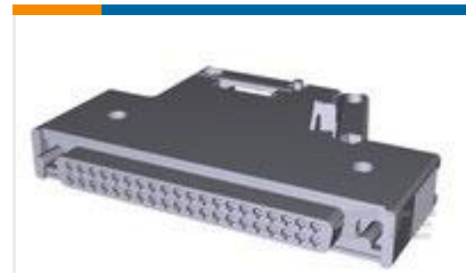
TE Part #1473381-1 PC I/O REC KIT BAG /1PCS.