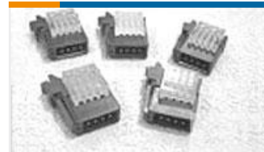
TE Part #1-1473562-4 RITS CONN. PLUG ASSY 4P RED