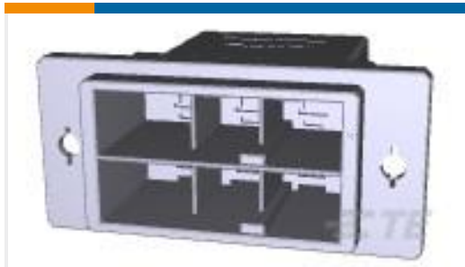
TE Part #1-917809-3 DYNAMIC D-5 TAB HSG D/R 6P X-X