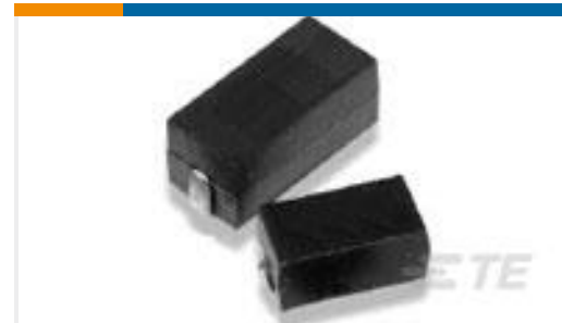
TE Part #2-1879234-8 SMF5 6K8 5%