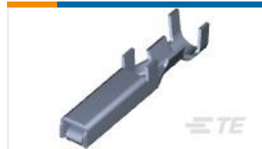
TE Part #1-175217-2 DYNAMIC D-3 REC CONT. M AU 0.38 L/P