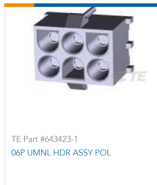
TE Part #643423-1 06P UMNL HDR ASSY POL