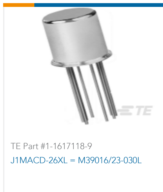
TE Part #1-1617118-9 J1MACD-26XL = M39016/23-030L