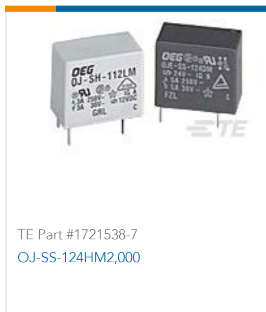
TE Part #1721538-7 OJ-SS-124HM2,000