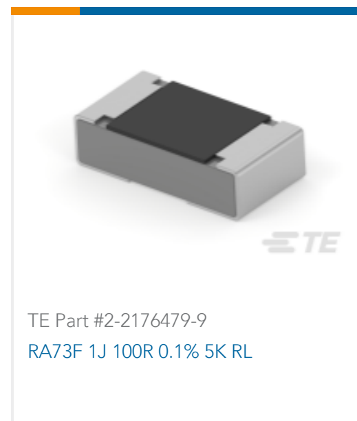
TE Part #2-2176479-9 RA73F 1J 100R 0.1% 5K RL