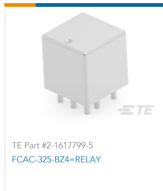
TE Part #2-1617799-5 FCAC-325-BZ4=RELAY