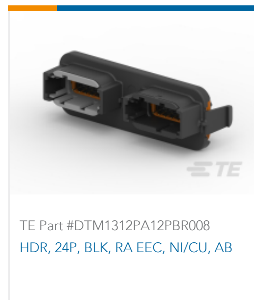
TE Part #DTM1312PA12PBR008 HDR, 24P, BLK, RA EEC, NI/CU, AB