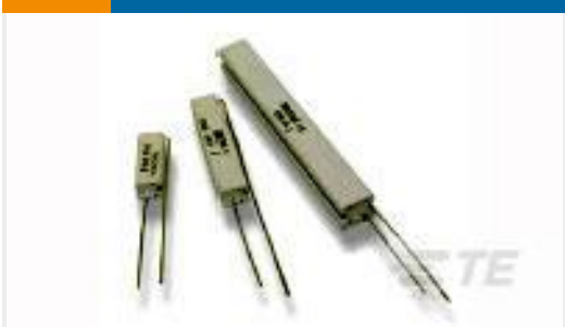
TE Part #1-1623728-3 BCHE 11 W 22R 5%