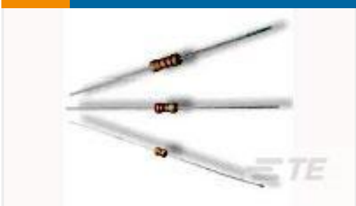
TE Part #1623927-4 CFR16 5% 10K