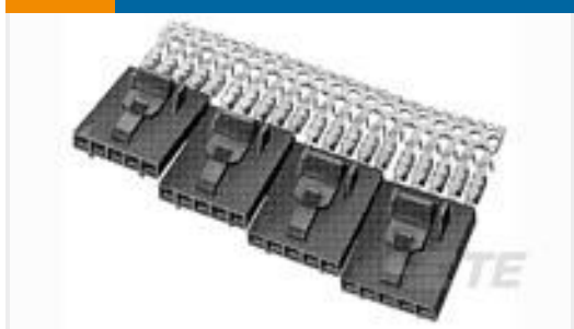
TE Part #5-103957-5 4X6 MTE RCPT SR LATCH .100CL