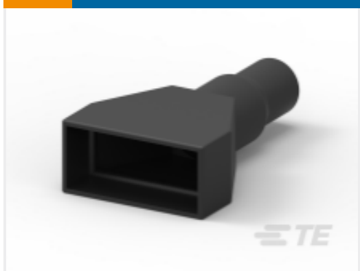
TE Part #DRC40-BT BOOT, 40P, 16SZ, PLG/REC, ST, BLK