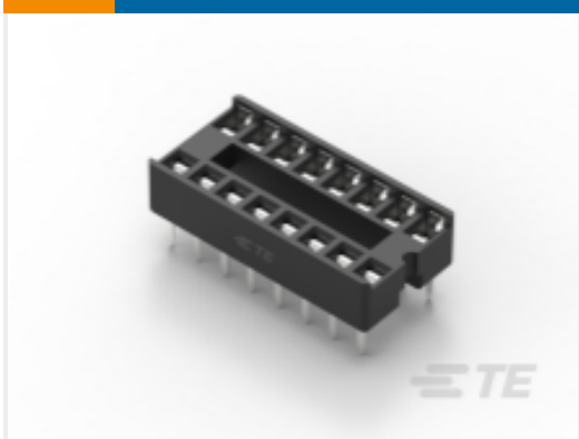
TE Part #1-2199298-5 DIP Socket: Low Profile, Stamped & Formed, Open, Tin