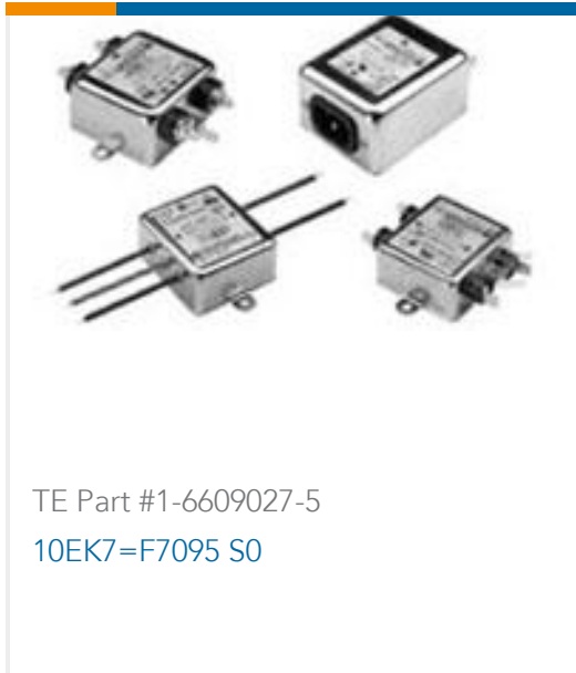
TE Part #1-6609027-5 10EK7=F7095 S0