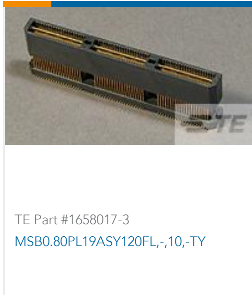
TE Part #1658017-3 MSB0.80PL19ASY120FL,-,10,-TY