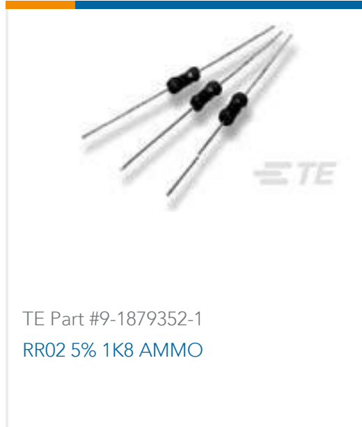
TE Part #9-1879352-1 RR02 5% 1K8 AMMO