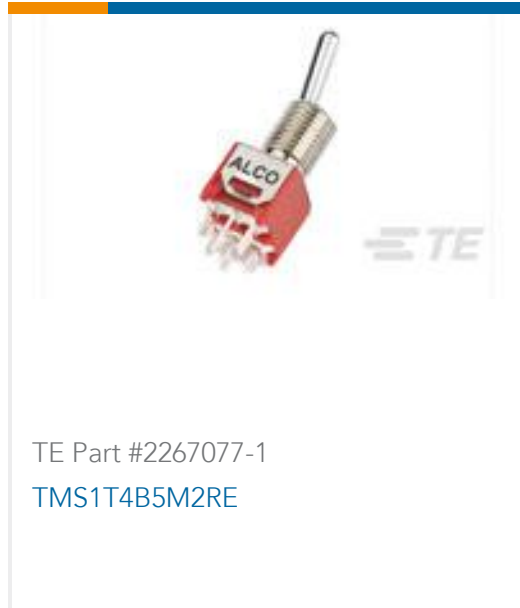
TE Part #2267077-1 TMS1T4B5M2RE