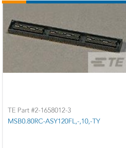
TE Part #2-1658012-3 MSB0.80RC-ASY120FL,-,10,-TY