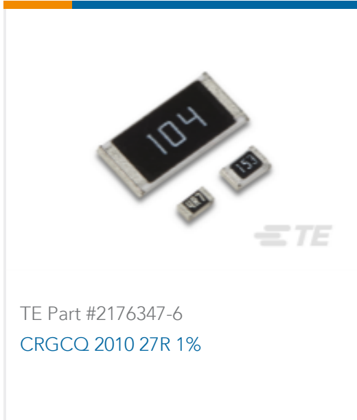
TE Part #2176347-6 CRGCQ 2010 27R 1%