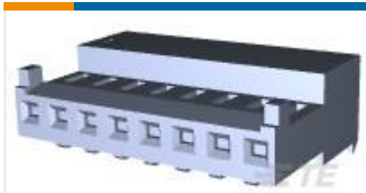
TE Part #3-643816-8 08P MTA100 CONN ASSY POL RIB