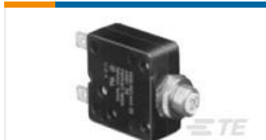
TE Part #1-1393249-6 W58-XB1A4A-30=W58