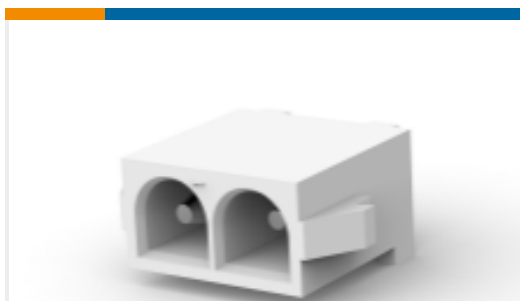
TE Part #2213752-1 2 POS HIGH TEMP MATE-N-LOK PIN ASSM