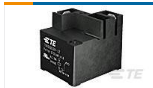
TE Part #1-1393210-2 T9AS1D12-110