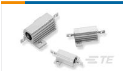
TE Part #1-1879071-3 THS50 1R5 5%