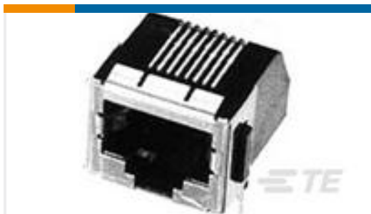
TE Part #5555153-1 MJ,LPF,R/A,8P,PCBG,PSTP.15TTR