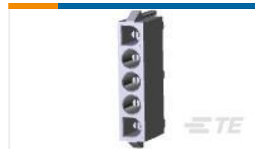
TE Part #643406-1 05P UMNL PIN HDR ASSY POL 94VO