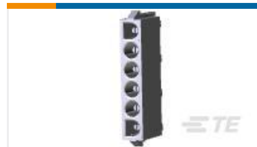
TE Part #643408-1 06P UMNL PIN HDR ASSY POL 94VO