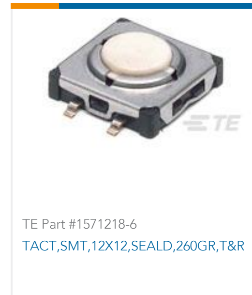
TE Part #1571218-6 TACT,SMT,12X12,SEALD,260GR,T&R