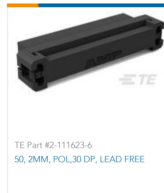
TE Part #2-111623-6 50, 2MM, POL,30 DP, LEAD FREE