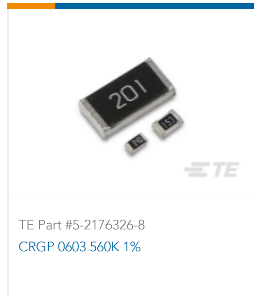
TE Part #5-2176326-8 CRGP 0603 560K 1%