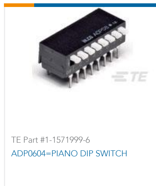
TE Part #1-1571999-6 ADP0604=PIANO DIP SWITCH