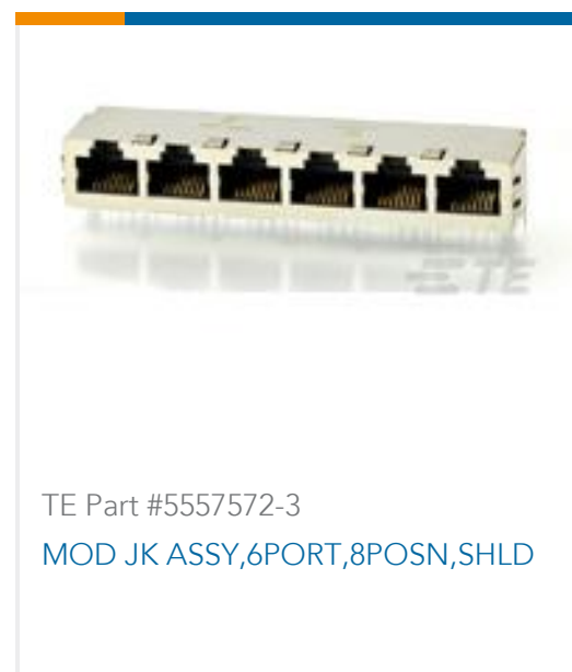
TE Part #5557572-3 MOD JK ASSY,6PORT,8POSN,SHLD