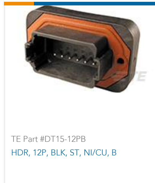
TE Part #DT15-12PB HDR, 12P, BLK, ST, NI/CU, B