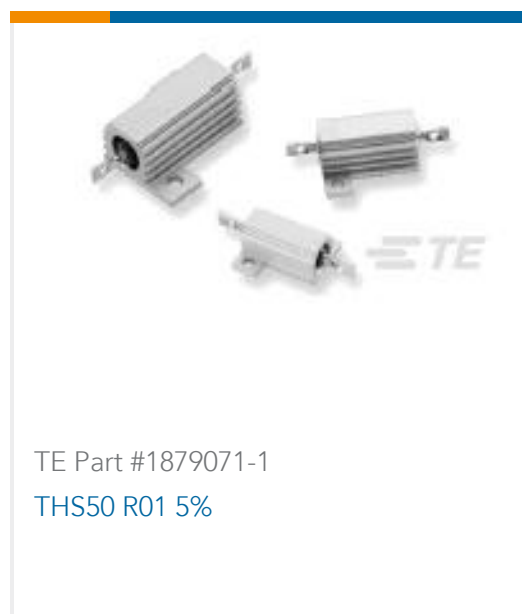
TE Part #1879071-1 THS50 R01 5%