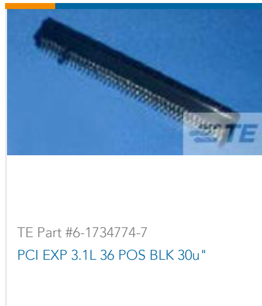
TE Part #6-1734774-7 PCI EXP 3.1L 36 POS BLK 30u"