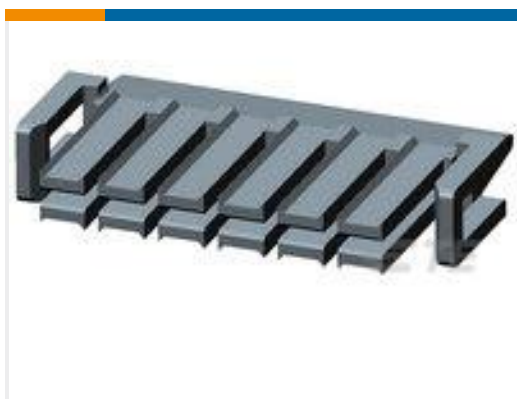
TE Part #1969541-8 RETAINER, TPA, DUAL ROW, EP2.5