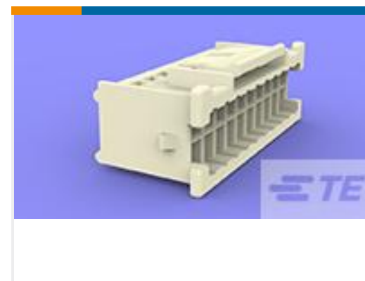
TE Part #1-1969540-8 HOUSING, PLUG, 18P,DUAL ROW, EP2.5