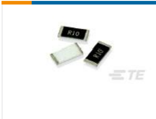
TE Part #2-1622825-4 RL73K 3A R56 5% 1K RL