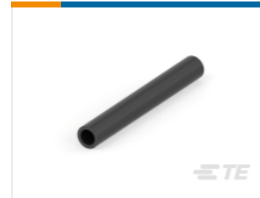
TE Part #2525596019 RBKILS Heat shrink Tubing