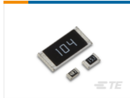
TE Part #3-2176341-8 CRGCQ 0805 12K 1%