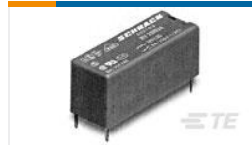
TE Part #4-1393224-9 RY211024