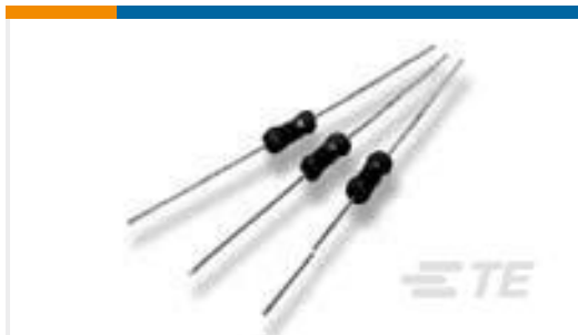
TE Part #4-1625885-7 1W SM M/OX 5% 22R