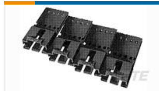
TE Part #103653-5 06 MTE SHRD PIN HSG SR LATCH