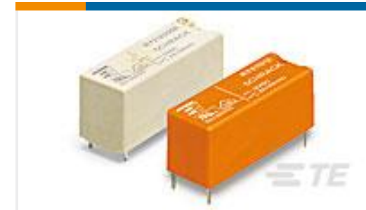
TE Part #1-1393225-7 RY611005