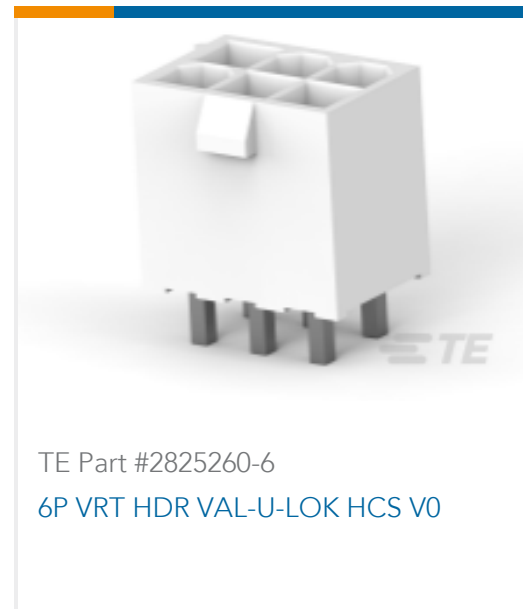
TE Part #2825260-6 6P VRT HDR VAL-U-LOK HCS V0