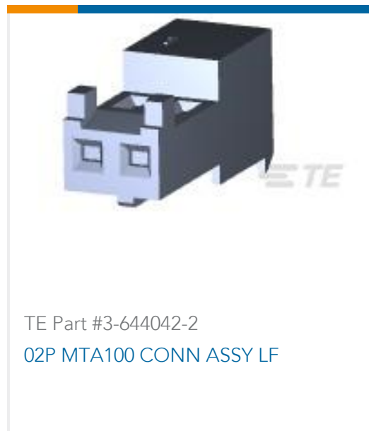
TE Part #3-644042-2 02P MTA100 CONN ASSY LF