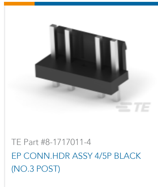
TE Part #8-1717011-4 EP CONN.HDR ASSY 4/5P BLACK (NO.3 POST)