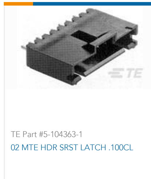
TE Part #5-104363-1 02 MTE HDR SRST LATCH .100CL