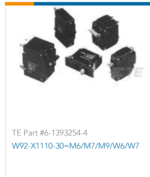
TE Part #6-1393254-4 W92-X1110-30=M6/M7/M9/W6/W7