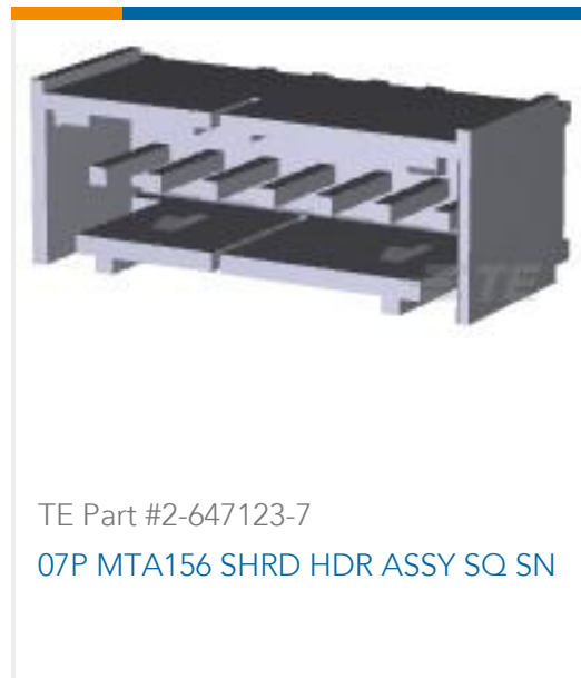
TE Part #2-647123-7 07P MTA156 SHRD HDR ASSY SQ SN