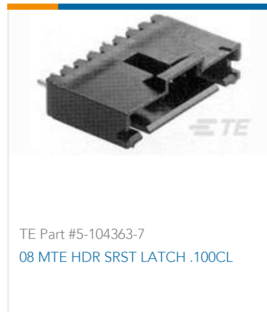
TE Part #5-104363-7 08 MTE HDR SRST LATCH .100CL