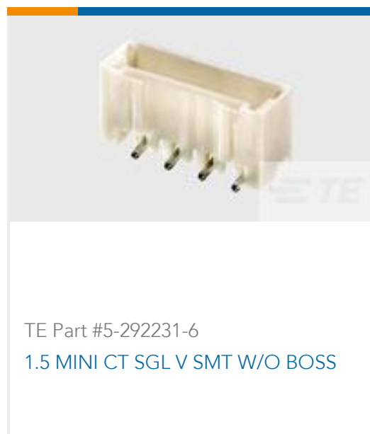
TE Part #5-292231-6 1.5 MINI CT SGL V SMT W/O BOSS