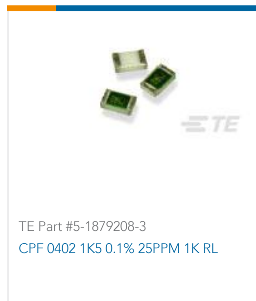
TE Part #5-1879208-3 CPF 0402 1K5 0.1% 25PPM 1K RL