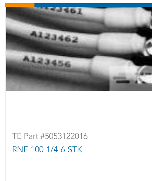
TE Part #5053122016 RNF-100-1/4-6-STK