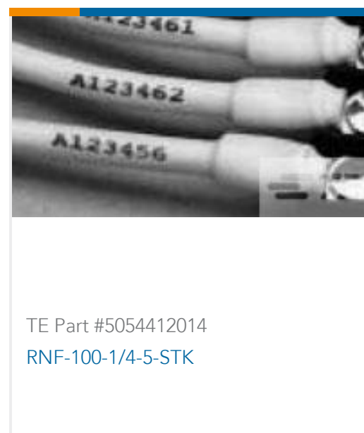
TE Part #5054412014 RNF-100-1/4-5-STK