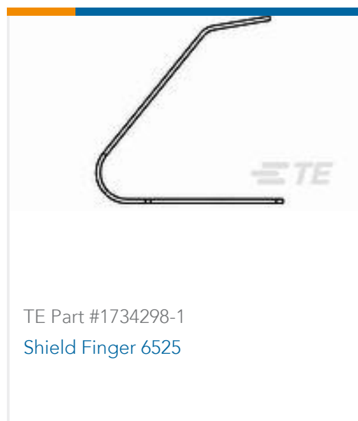
TE Part #1734298-1 Shield Finger 6525